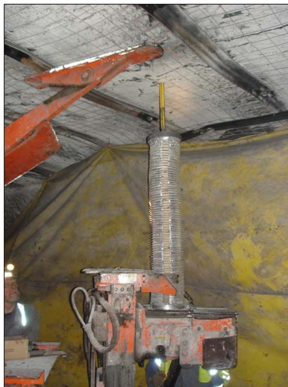
Figure 1.—The CDSE at the start of drilling. The gap above the CDSE allows the operator to see the drill bit/media interface to start the hole. The height of the CDSE can be varied to suit the particular application.

Laboratory testing in a reverberation chamber (for sound power level) and hemianechoic chamber (for noise source identification and operator ear sound pressure level) showed that