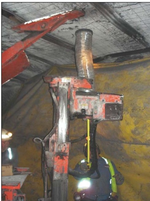
Figure 3.—As drilling advances, the CDSE collapses.