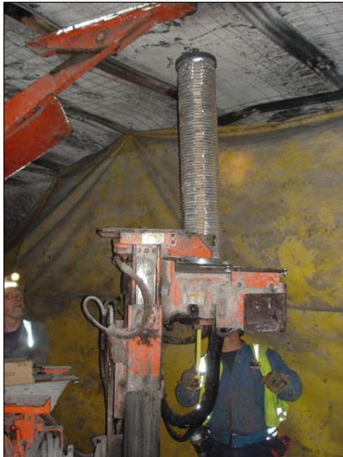
Figure 2.—The CDSE is now flush with roof.

JPeterson@cdc.gov ) or Lynn A. Alcorn (412-386-6732, LAlcorn@cdc.gov ), NIOSH Pittsburgh Research Laboratory, P.O. Box 18070, Pittsburgh, PA 15236-0070.