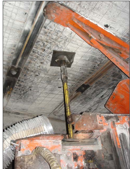
Figure 4.—Once drilling is completed, the CDSE is moved aside so the roof bolt can be installed.