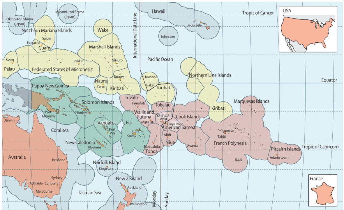
Figure 1: Map of the Pacific region

Green islands are part of Melanesia, red islands are part of Polynesia, and yellow islands are part of Micronesia.