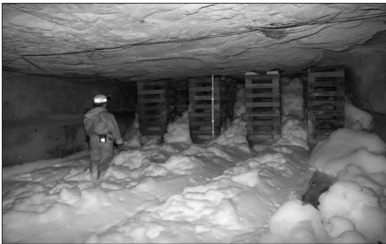
Figure 3. Compressed air gas-enhanced foam accumulating behind and moving through crib block sets at the LLEM.

Remote Methods for Addressing Coal Mine Fires – The ability to remotely address coal mine fires can reduce worker exposure to hazardous situations. The objective of this work is to evaluate, improve or modify remote fire-fighting technologies, including remotely installed mine seals (ventilation barriers), and fire control and suppression technology. This research effort is being conducted with active industry participation and with the input from MSHA technical specialists serving as research partners. Full-scale remote mine seal installation experiments have been conducted to evaluate cement-based and rigid-foam based materials at the NIOSH Lake Lynn Experimental Mine (LLEM). The LLEM (located approximately 97 km (60 mi) southeast of Pittsburgh, Pennsylvania) is a world-class, highly sophisticated underground facility where large-scale explosion trials and mine fire research is conducted. This work has resulted in new understandings of the limitations of the technology and development of novel downhole tools to facilitate accurate placement of mine seal materials. Preliminary research on nitrogen gas-enhanced foam (foam resulting from commingling of nitrogen gas, water and a specialized foam concentrate) shows that foam can be stable in the mine opening and can accumulate and flow through mine workings (figure 3).