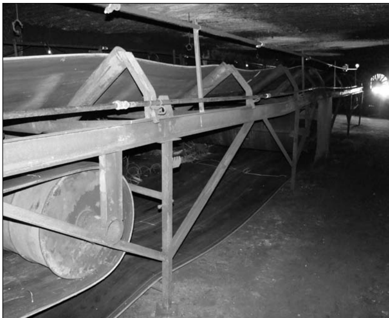
Figure 2. Conveyor belt fire suppression system set-up at the NIOSH Fire Suppression Facility (Rowland, 2008).

Conveyor Belt Fire Suppression – NIOSH, in partnership with the Mine Safety and Health Administration (MSHA), initiated a test program to determine the effectiveness of fire suppression systems on conveyor belt fires in entries with high-velocity air flow (figure 2). Full-scale experiments evaluated the effectiveness of dry powder chemical suppression systems, water sprinkler systems, and water deluge systems in conveyor belt entries at air velocities of 0, 2.5 and 7.1 m/sec (0, 500, and 1400 ft/min). The data from this work will be used to develop guidelines for the installation and use of fire suppression systems in ventilated belt entries. In late 2007, the scope of this research was modified to include the recommendations made by the Technical Study Panel on the utilization of belt air and the composition and fire retardant properties of belt materials in underground coal mining (Mutmansky, 2007).