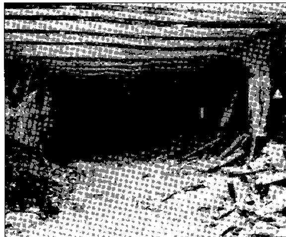
Figure 2.—Gate road supported by resin-grouted cable has already been subjected to first panel loading. Panel 2 is approximately 60 meters (200 feet) in by this location.