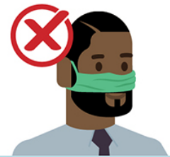
Only on your nose