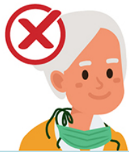
Around your neck