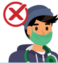
Under your nose