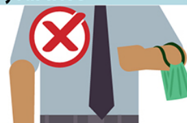
On your arm