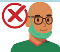
On your chin