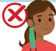
Dangling from one ear