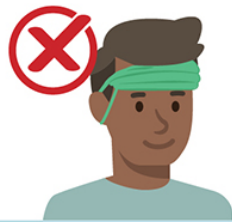
On your forehead