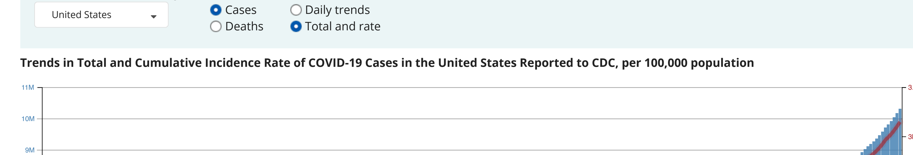
Trends in Total and Cumulative Incidence Rate of COVID-19 Cases in the United States Reported to CDC, per 100,000 population

Reported to the CDC by State or Territory