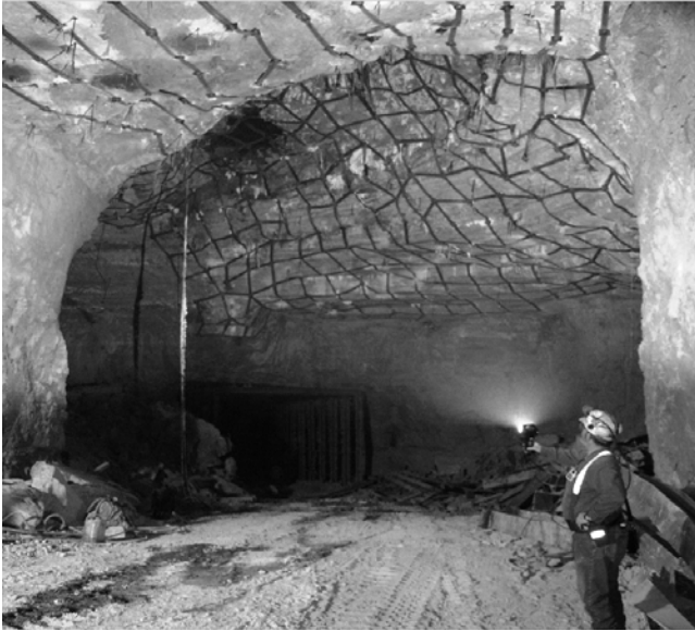
Figure 4. Repair of a large roof fall in which horizontal stress is thought to have contributed to the failure.

The average roof beam thickness in mines that were able to mine without regular support was 2.25 m (7.4 ft), while the average beam thickness in the mines that were using regular roof support was 1.3 m (4.3 ft). Several of the mines that used regular support do so to alleviate the effects of horizontal stress, which is not related to beam thickness. If these mines are removed from the data, the average beam thickness in mines that use regular support drops to 0.8 m (2.6 ft). These results seem to indicate that mines with a relatively thin beam of limestone in the immediate roof are more likely to encounter unstable roof and regular roof bolting becomes necessary.