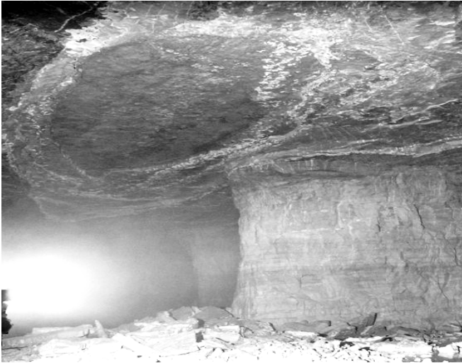
Figure 1. Typical oval shaped roof fall associated with horizontal stress in the roof.

horizontal stress and are oval shaped when seen in plan view, see figure 1. Careful observation of the roof falls and other signs of excessive stress can assist in identifying the orientation of the maximum horizontal stress (Mark and Mucho, 1994).