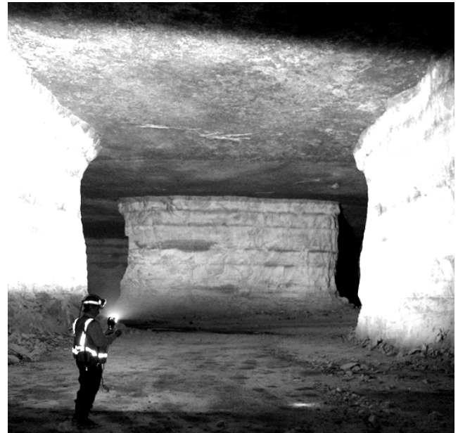
Figure 3. Naturally stable 13 m (44 ft) wide roof spans in a limestone mine in the Central Plains region.

In addition to small scale rock falls, large roof falls were observed at 19 of the 30 mines that experienced small scale roof instability. The large falls made up a very small percentage of the exposed roof in the mines; many of the mines only had a single instance of a large roof fall. Roof falls were categorized by identifying the most significant factor contributing to each fall, as