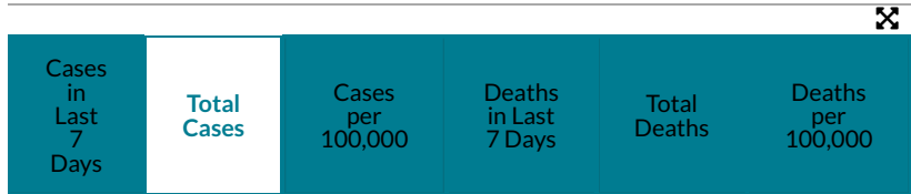
Total Number of COVID-19 Cases in the US Reported to the CDC, by State/Territory