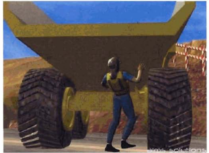
Figure 7. Scene from an accident recreation

Researchers at NIOSH are exploring how the mining industry can effectively use "serious games" for mine training. They have used a game engine to create a portion of an underground coal mine. In this virtual mine, trainees have a first person vantage point as they walk or ride through the mine. The first training package in this virtual mine instructs new miners in how to read mine maps.