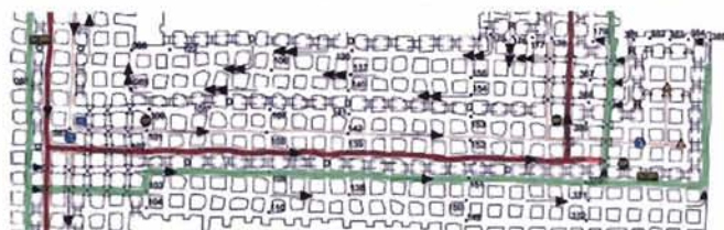
Figure 9. Mine Navigation Challenge map

of the virtual reality technology allowed them to learn from each other and to see how their knowledge and skill sets complement each other. As a group, the participants were addressing issues in the contexts of a wide range of mine settings. They were studying underground and surface operations and a variety of mining methods and processes.