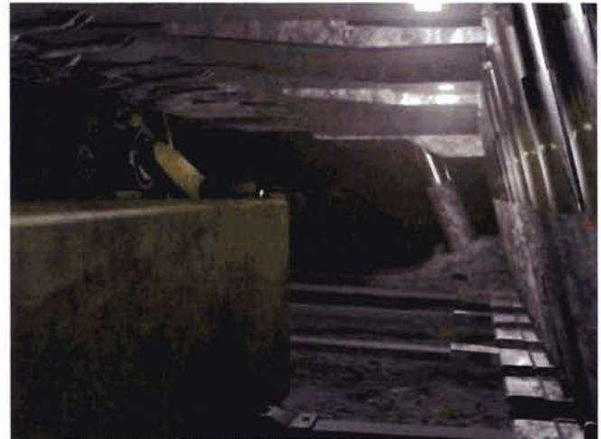
Figure 3. VR simulation of a tailgate drive

a VR simulator of a roadheader that provides realistic visual, sound and physical sensations (Figures 5 and 6). Along with the usual mock-up of the equipment and a computer-generated environment, a motion platform simulates the incline and feel of the machine. Plans are to build a simulator of a drilling rig next.