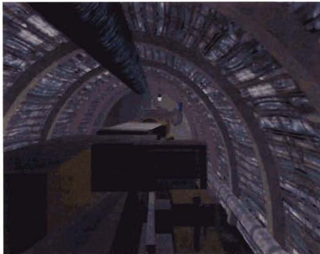
Figure 6. AITEMIN roadheader simulation – operator's view in exercise

VPI has also developed AMADEUS (Adaptive and real-time geologic Mapping, Analysis, and DEsign of Underground Space) that provides 3D visualization (Figure 8) of information for digital imaging and image analysis, tomographic imaging, modeling and analysis of rock masses, and the design of tunnels and other underground spaces.