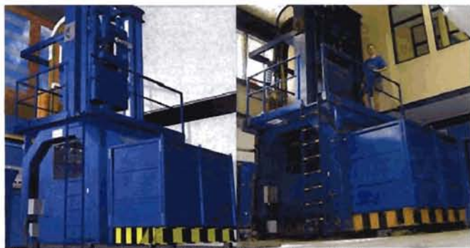
Figure 2. Left - simulated drill rig, Right - actual drill rig

Researchers and faculty at MISHC have created VR applications to address a number of mining industry issues such as safety training, mining engineering education, accident reconstruction, data visualisation, mine planning, and environmental hazard assessment. One of their simulations is used to teach drill rig operation (Figure 2). They also use VR to provide a holistic approach to learning in their engineering program. Assignment data, such as spreadsheets, photographs, schematics and textual descriptions, which were previously distributed via printed course materials, are now presented in the realistic context of a VR mine.