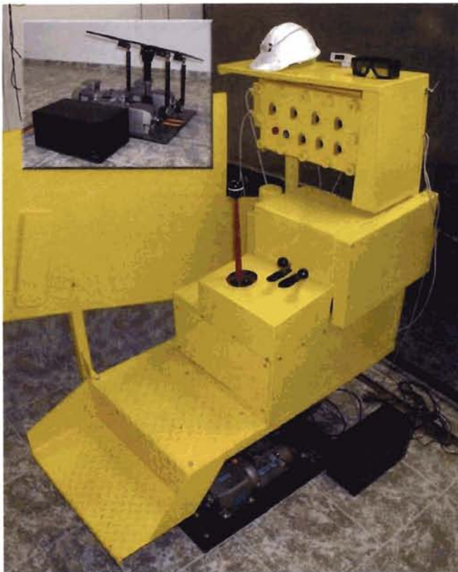
Figure 5. AITEMIN roadheader simulation - operator's compartment mockup with motion platform