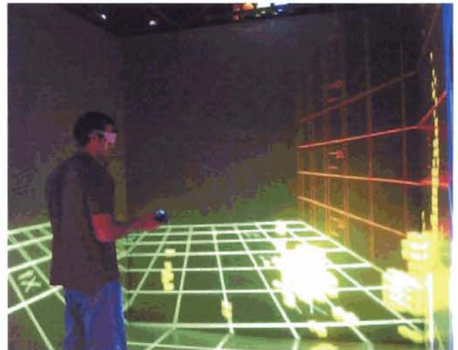
Figure 8. A view of AMADEUS

The Mine Navigation Challenge allows trainees to move freely in six entries and approximately 35 crosscuts of the virtual mine environment (Figure 9). They start the training by boarding the mantrip where the operator gives them their work assignment. The operator tells them to pick up tools and take them to the supervisor who is working at a certain location. They must use their map to plot their course and then virtually walk to the supervisor's location. To be successful, they must know where they can go (such as through a mandoor) and where they cannot (such as under the belt). When they have found the supervisor, he will give further instructions for the next task (Figure 10).