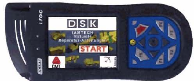
Figure 4. Repair assistance on PDA