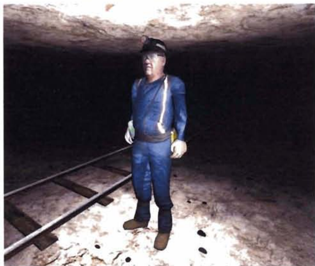
Figure 10. Mine Navigation Challenge virtual miner

Some organizations were working exclusively in the mining industry. Even in those cases, programs were addressing the needs of a heterogeneous audience. They focused on miners, managers, engineers, and/or students who differed in terms of age, gender, ethnicity, experience levels, and language. Workshop participants found targeting their work to the appropriate segment of the industry to be a common project requirement. They also found that most of them were addressing similar issues, such as meeting the needs of miners from different generations.