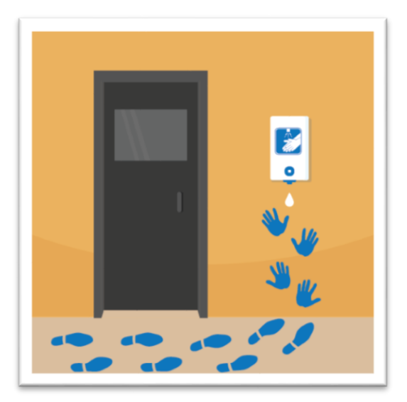
Nudges, or visual cues, to prompt students to sanitize their hands.