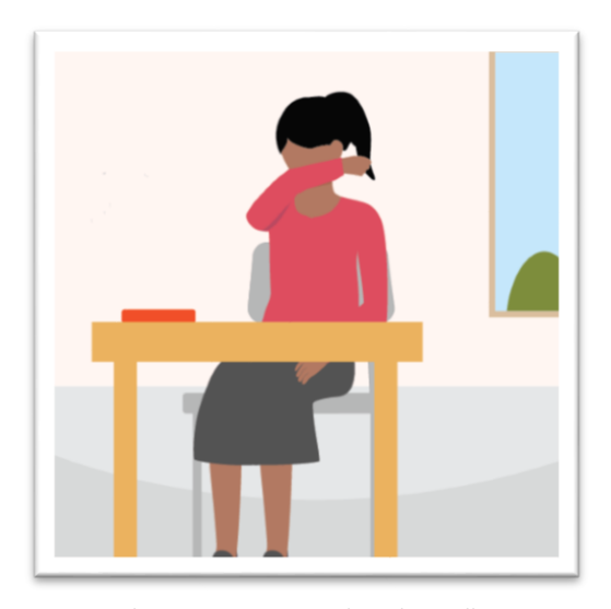
Student covering a cough with an elbow.