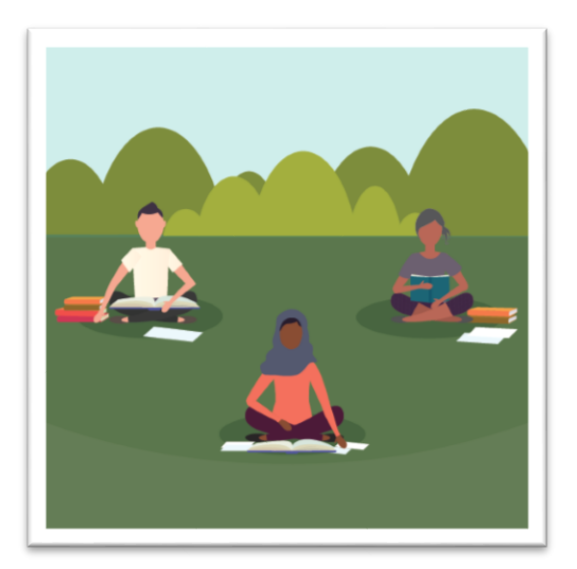
Classes can be moved outside if the conditions are favorable.