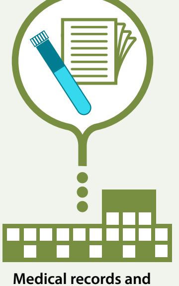
Medical records and specimens sent to CDC