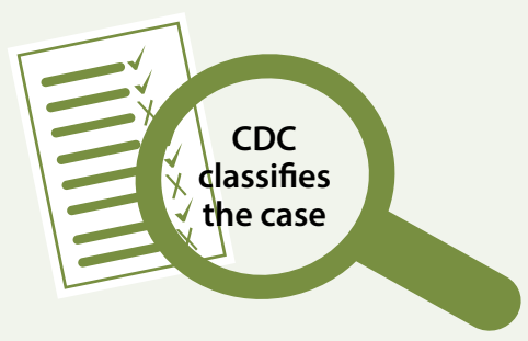
CDC sends case classification to