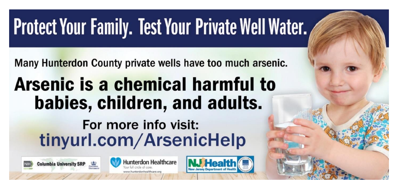
Figure S1. Billboard posted in Hunterdon County