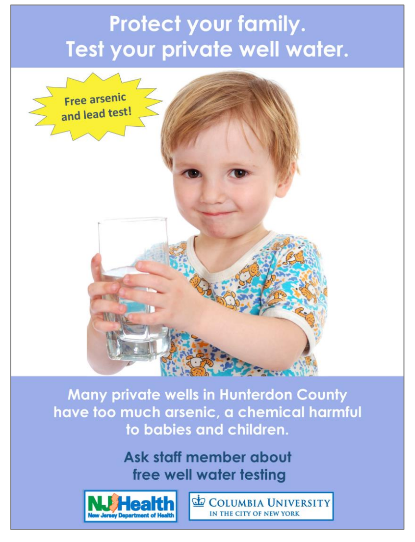
Figure S2. Poster in participating clinics