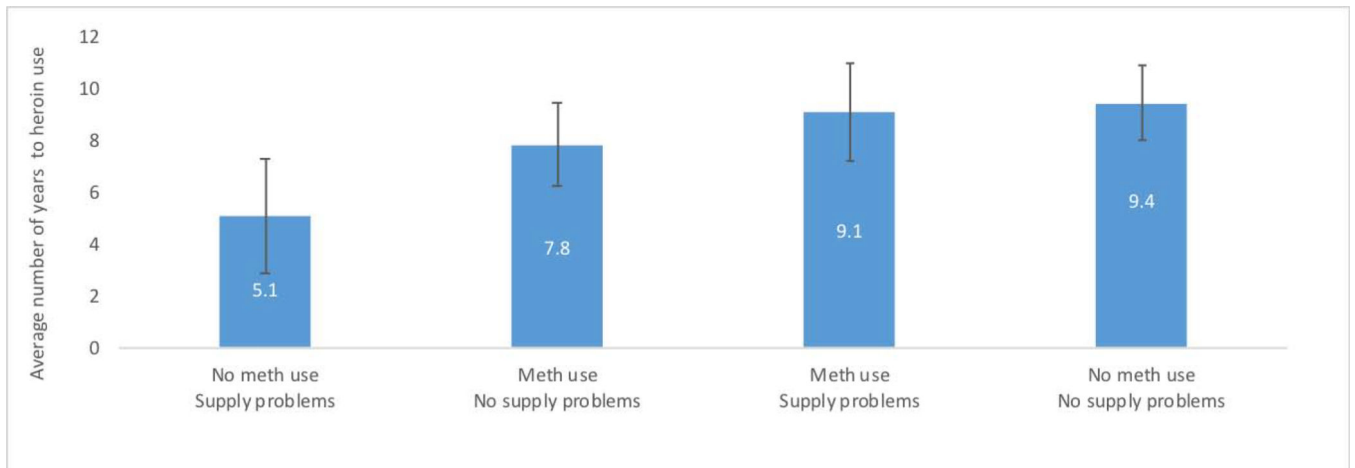
Figure 1: Average number of years between first pharmaceutical opioid use and first heroin use across four groups classified according to history of methamphetamine (meth) use and supply problems.