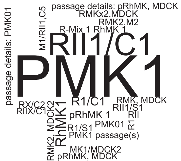
Figure 2. Word cloud of influenza A(H3N2) sequence annotations indicating passaging in one or more cell lines where at least one is a PMK cell line. Word height corresponds to number of sequences exhibiting a given pattern.

In an effort to strengthen influenza surveillance efforts, several databases of influenza sequences are maintained, the three largest of which are GISAID, IRD, and OpenFlu. Each of these databases collects sequences from different sources, although there is a fair amount of overlap (see Fig. 3A) as all include publicly available samples from the International Nucleotide Sequence Database Collaboration (INSDC, http://www.insdc.org ), stored in