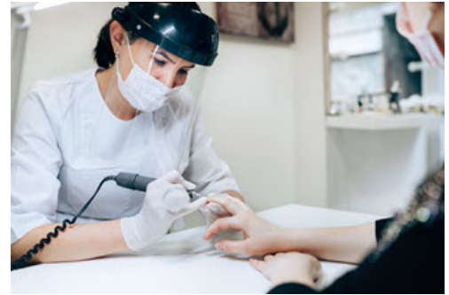
Wear a cloth face covering