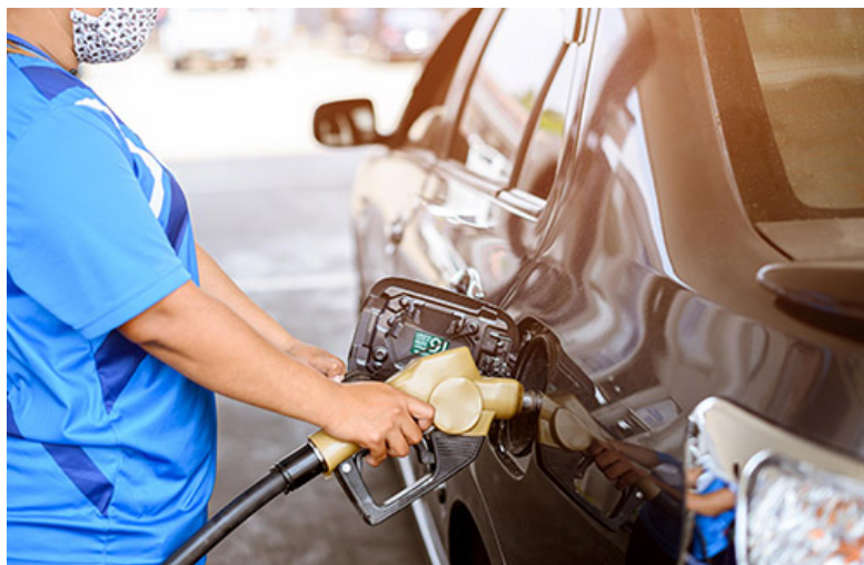
Use disinfecting wipes on handles