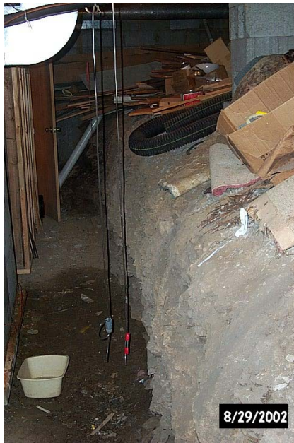
Figure 3. Rock ledge entry points.