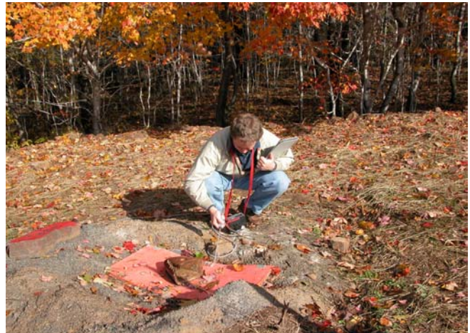
Figure 2. Borehole monitoring with sampling wand