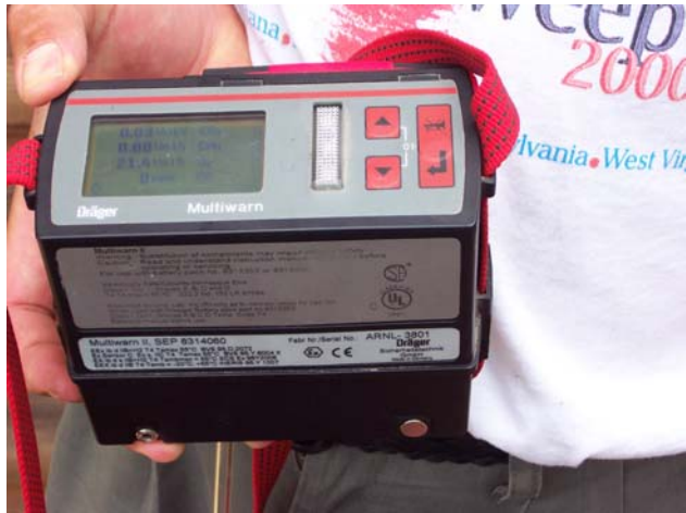
Figure 1. Dräger MultiWarn II

Field measurements are necessary to identify point sources and gas response to atmospheric conditions but are not as accurate as laboratory analyses. If the source is to be identified, grab samples are required.