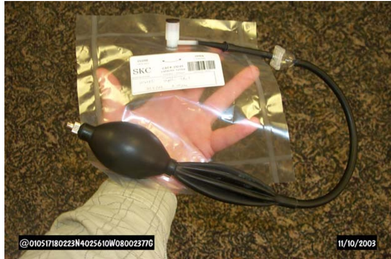
Figure 4. Aspirator pump and Tedlar bag