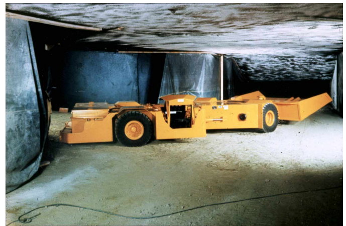
Figure 1– A scoop traveling along mine roadway.

Underground mine field data were collected at a mine near the town of Washington in Southwestern Pennsylvania. The coal seam thickness and mining height for the mine averaged 183 cm (72 in) with a range of 152 to 244 cm (60 to 96 in) for seam thickness. Seam height averaged about 66 inches in the area in which tests were conducted. NIOSH researchers collected vibration data on three rail vehicles and a rubber tired scoop with the same instrumentation used for laboratory tests: a data recorder, tri-axial accelerometers, signal conditioning amplifiers and in-line 150-Hz, low-pass filters. Data were gathered on existing seat designs for two personnel carriers or “mantrips,” a locomotive, and a mine scoop (Fig. 1). One mantrip (designated mantrip #1 in the results section) featured a NIOSH-based seat design supplied by a company collaborating with NIOSH research, while the