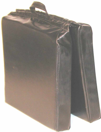
Figure 2 - The portable “throw pad” features connected seat and backrest pads with loop handle. 0

An example of a potential seat padding intervention for transport vehicles is the “throw pad” (Fig. 4) which was developed by RM Wilson Company in collaboration with management at the mine. It is a 35.6-cm (14-in) square and 6.4-cm (2-1/2-in) thick folding pad (covered in a black vinyl material) with a handle that workers could carry around with them. It was originally intended for maintenance workers, who needed the flexibility of a portable pad that can be used not only for sitting, but kneeling and lying down depending on the work task performed. NIOSH researchers are considering the “throw pad” as an intervention applicable for a variety of transport vehicles and optimizing the padding selection and configuration through laboratory vibration investigations.