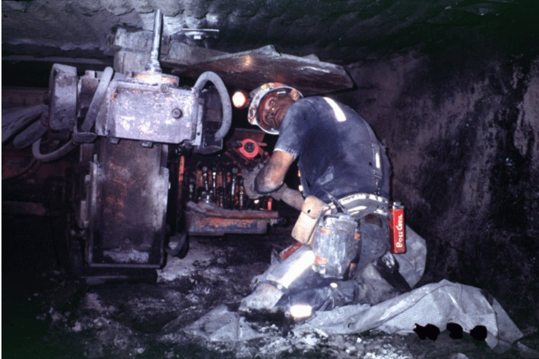
Figure 1. Roof bolting in a low seam mine often requires workers to maintain awkward postures.

used for high, medium and low coal seams. Typically in medium and low seams, the operator works in a small area between the machine and walls of coal called ribs. A roof bolter operator working in a low seam mine is illustrated in Figure 1. In high seams workers often work from a platform on the bolting machine. This case study evaluates workers roof bolting in a high seam mine. In general, bolting machine operators work in tight spaces.