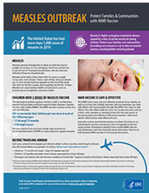
Protect Families & Communities with MMR Vaccine [1 page, 508]