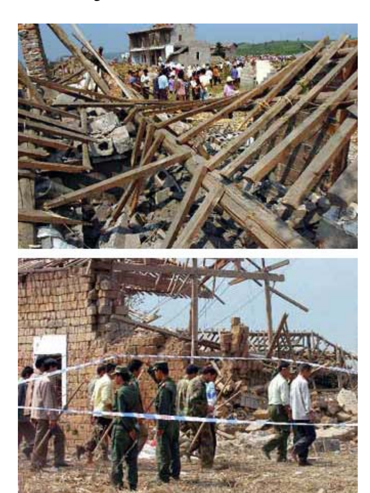
Figure 5. Damage caused by the 2005 explosion of an 18-MT (19.5-t) truckload of AN in Zhenganzhai, China.

On September 12, 2005 a truck carrying 18 MT (19.5 t) of AN exploded in the village of Shengangzhai, China<sup>14</sup>. It is unclear what caused the truck to explode. 12 villagers were killed and 43 were injured. The explosion produced a crater 18.5 m (60 ft) in diameter and 5.6 m (18 ft) deep. Some of the damage caused by the accident is shown in Figure 5.