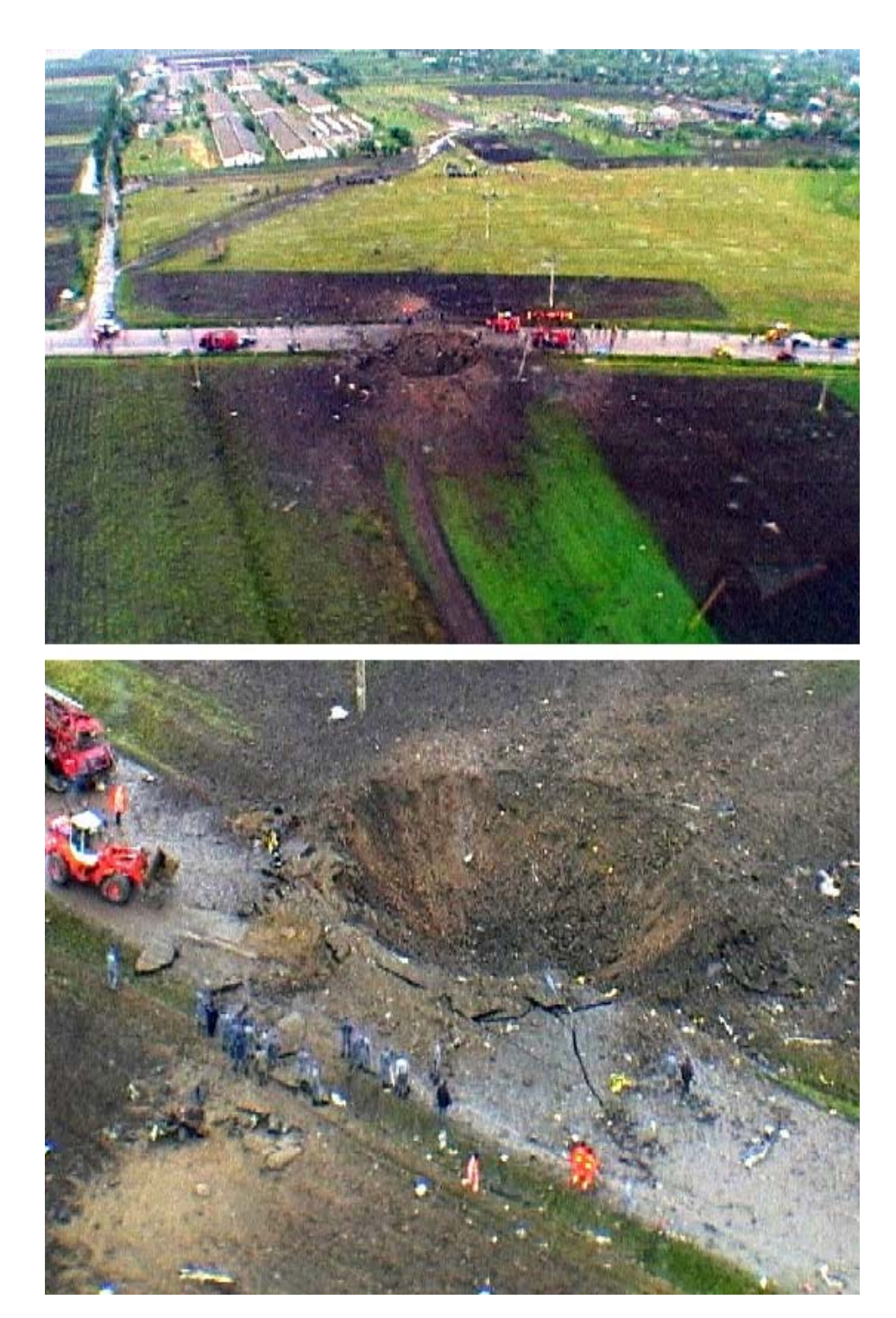
Figure 4. Accident in Romania in which 20 MT (22 t) of "nitrous fertilizer" caught fire and exploded, killing 17 people.

including 7 military firefighters, 2 journalists, 3 local people watching the fire, and 5 people who stopped their cars to watch the fire. Again the accident site should have been evacuated once the "nitrous fertilizers" started burning.