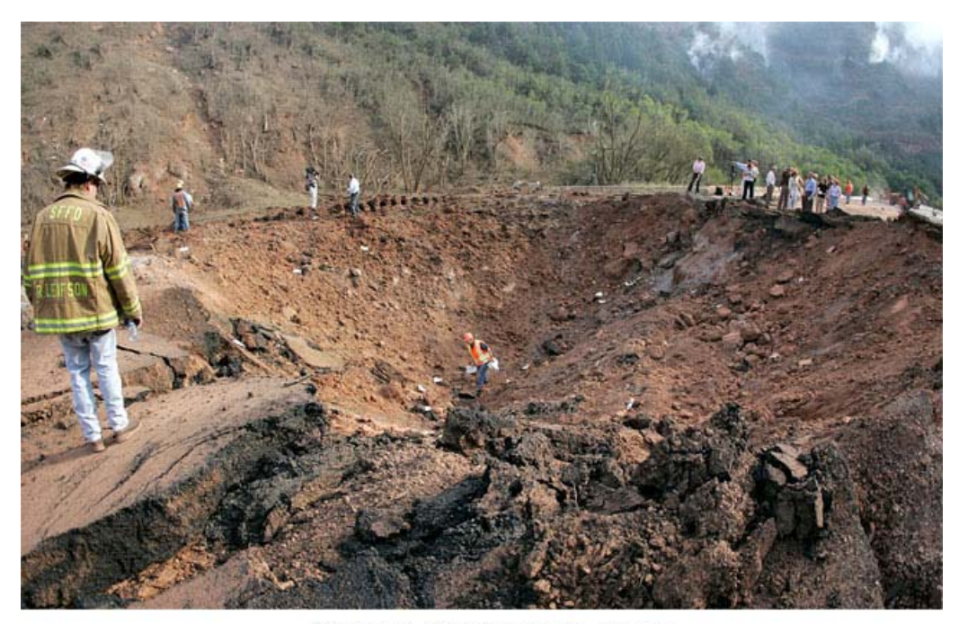
Crater, 20-35 feet deep

accident was consistent with the guidelines in USDOT ERG; people were evacuating the accident site as quickly as possible.