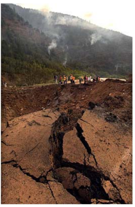
Crater and damaged roadway