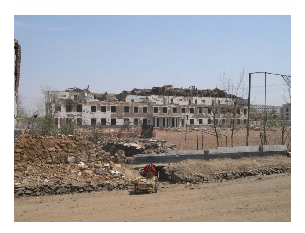
Figure 3. Ryongchon Primary School was severely damaged by the train explosion.

Figure 4.) The driver tried to extinguish the fire but when he was unable to he asked for help at a nearby village. A few cars stopped and some curious people watched the fire. A television news crew filmed the fire. Firefighters arrived and were preparing to fight the fire. The truck exploded killing 20 people,