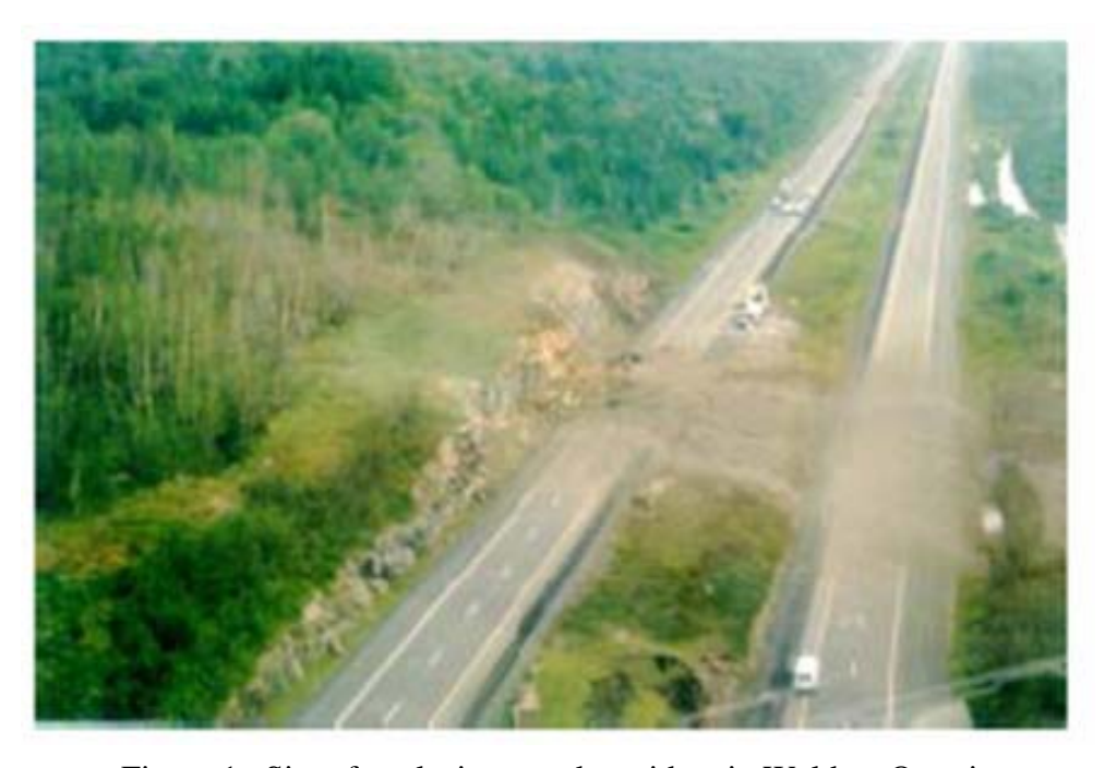
Figure 1. Site of explosives truck accident in Walden, Ontario.

On August 5, 1998 an explosives truck consisting of a tractor and trailer carrying 18,000 kg (40,000 lb) of blasting explosives went off the road near Walden, Ontario, Canada<sup>5,6,7</sup>. A fire started immediately. Drivers passing by stopped and helped the driver exit the truck and took him to safety. Explosive placards and the driver's warning alerted people to the hazard and they evacuated the site. The truck exploded about 35 minutes after the accident. The explosion caused two minor injuries, threw fragments of the truck up to 2,740 m (5,800 ft), and damaged several houses. At the time the truck exploded firefighters were in contact with the Canadian Transport Emergency Centre (CANUTEC) and were advised against approaching the scene. Evacuation of the accident site prevented any fatalities or serious injuries. The accident scene is shown in Figure 1.