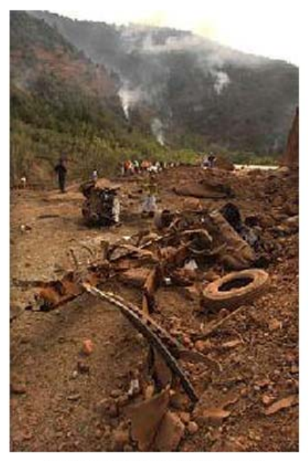
Remains of truck