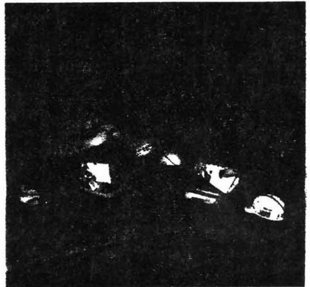
Figure 2.--Donning SCSR's

This first phase of the program, focused on education, is a key component of the intervention. The more information people have about stress the better they can recognize it in themselves and others, and seek help. Pre-incident education can lessen the need for the allocation of greater resources for post-incident rehabilitation. (14)