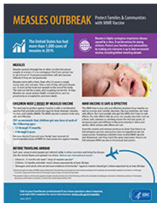
Protect Families & Communities with MMR Vaccine [1 page, 508]