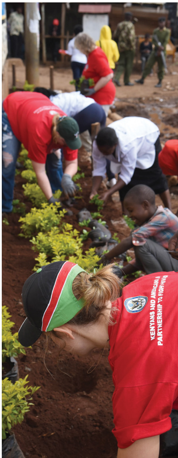
More than 40 U.S. Embassy members volunteered at the Kibera Community Health Center — site to over 11,000 patients that receive free HIV care and treatment.

The year 2018 was particularly important for PEPFAR, as it marked the fifteenth anniversary of its enactment. When PEPFAR began, only 7,800 Kenyans living with HIV were on lifesaving antiretroviral treatment. Today, more than 1 million men, women and children are on treatment and able to live positively. To help celebrate these gains, the U.S. Department of State hosted a number of initiatives including a World AIDS Day 2018 event at one of the first PEPFAR sites, a gender-based violence photo exhibition, and a documentary highlighting the HIV journey in Kenya.