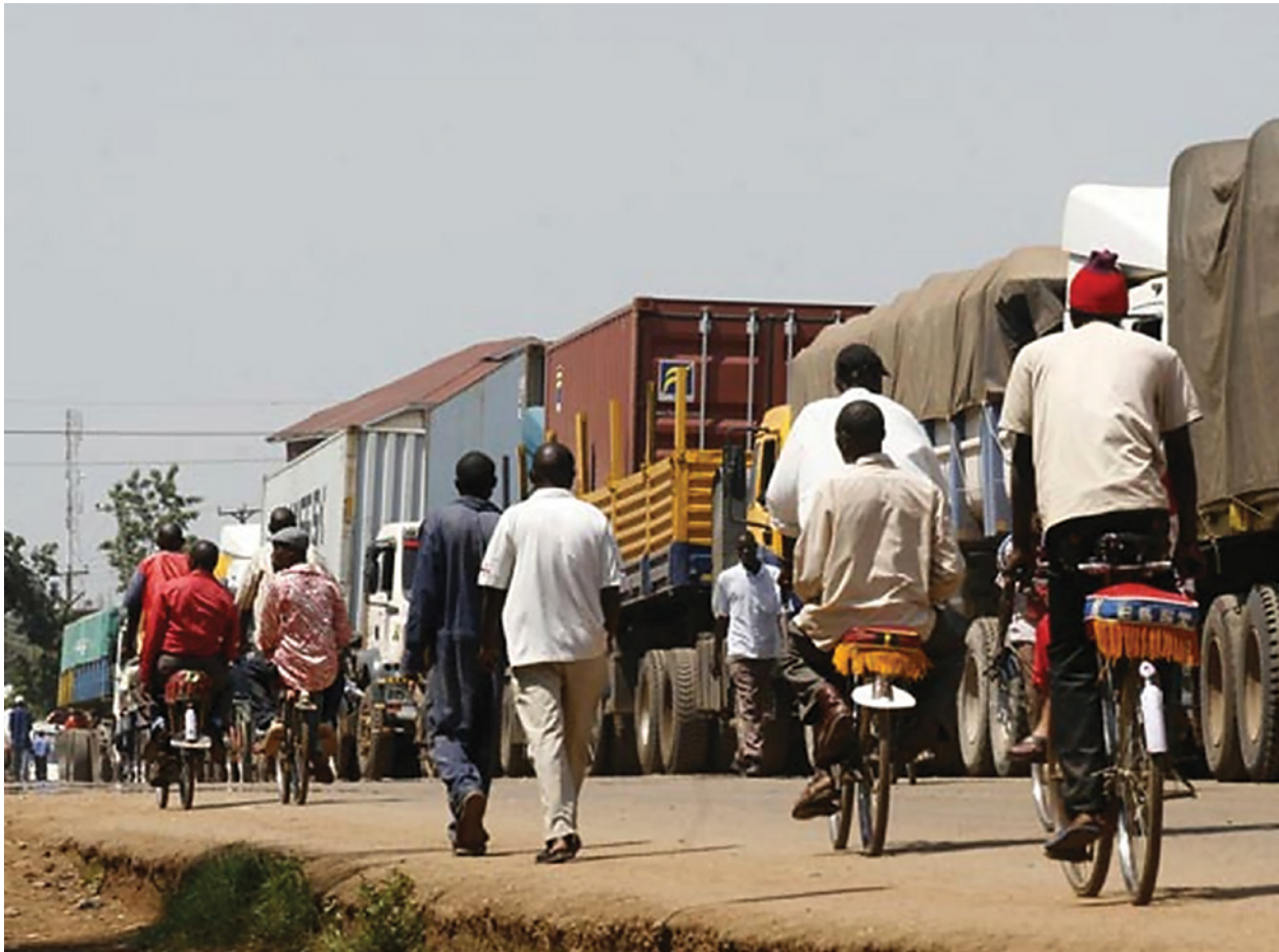
Malaba border crossing in western Kenya.

In light of recent infectious disease outbreaks in Africa, the Government of Kenya recognized the need to further improve port health services. Effectively mitigating the importation, or exportation, of infectious diseases and other public health threats requires strong national—and ports of entry (POE)—level preparedness and response capacity and cross-border collaboration. In 2018, the Kenya Ministry of Health's Port Health Services (PHS) adapted and implemented CDC's Division of Global Migration and Quarantine Border Health Capacity Discussion Guide . Through this process, tailored action plans were developed to address identified areas for improvement to strengthen services at two ground crossings (Busia and Malaba) and Jomo Kenyatta International Airport (JKIA). Busia and Malaba POE border Uganda and are the busiest with over 3,000 international travelers and 1,600 vehicles