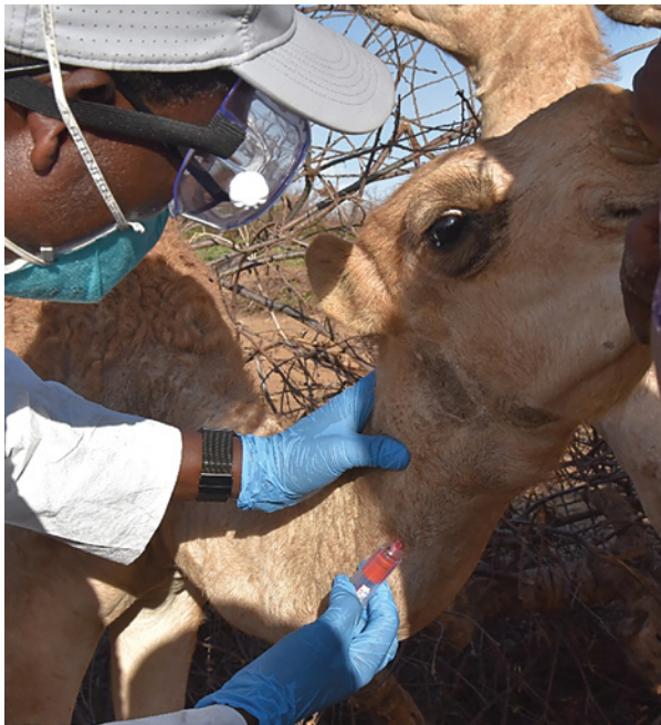
Taking a blood sample from a camel in Marsabit County, Kenya to test for zoonotic pathogens including MERS-CoV.

cohort study of pregnant women in Mombasa. Women enrolled in the study when they first come for antenatal care and are followed up monthly until delivery. They are then assessed for acute Zika infection and the newborns are screened for any congenital abnormalities. To date, after testing more than 1,000 women, CDC Kenya have not identified any cases of Zika infection, suggesting that Zika is currently not a major threat to women in coastal Kenya.