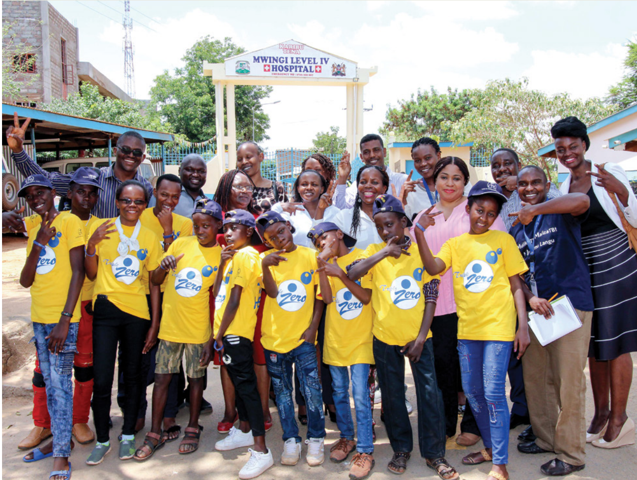
In November 2018, CDC Kenya organized a week long site visit with staff from CDC and USAID offices located in Nigeria, Ethiopia, Malawi, and Mozambique.

OTZ scale-up in Kenya has realized exponential growth from just one facility with 70 adolescents enrolled in 2016, to reaching approximately 47,000, or just over 60%, of all adolescents living with HIV. Data from 19 early-adopter partners show an average viral suppression of 85% in Kenyan youth enrolled in OTZ.