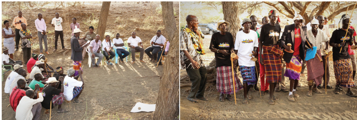
Members of Epedor meet and discuss life issues. The group has also helped to bolster household food security in the often drought-affected region of Turkana.

likely to know their status, practice consistent prevention, or access treatment." CDC, together with its implementing partners, is leading the way to identify effective strategies that reach men so that they know their status, stay on treatment and manage their health—one such strategy is taking off in the remote areas of Turkana County.