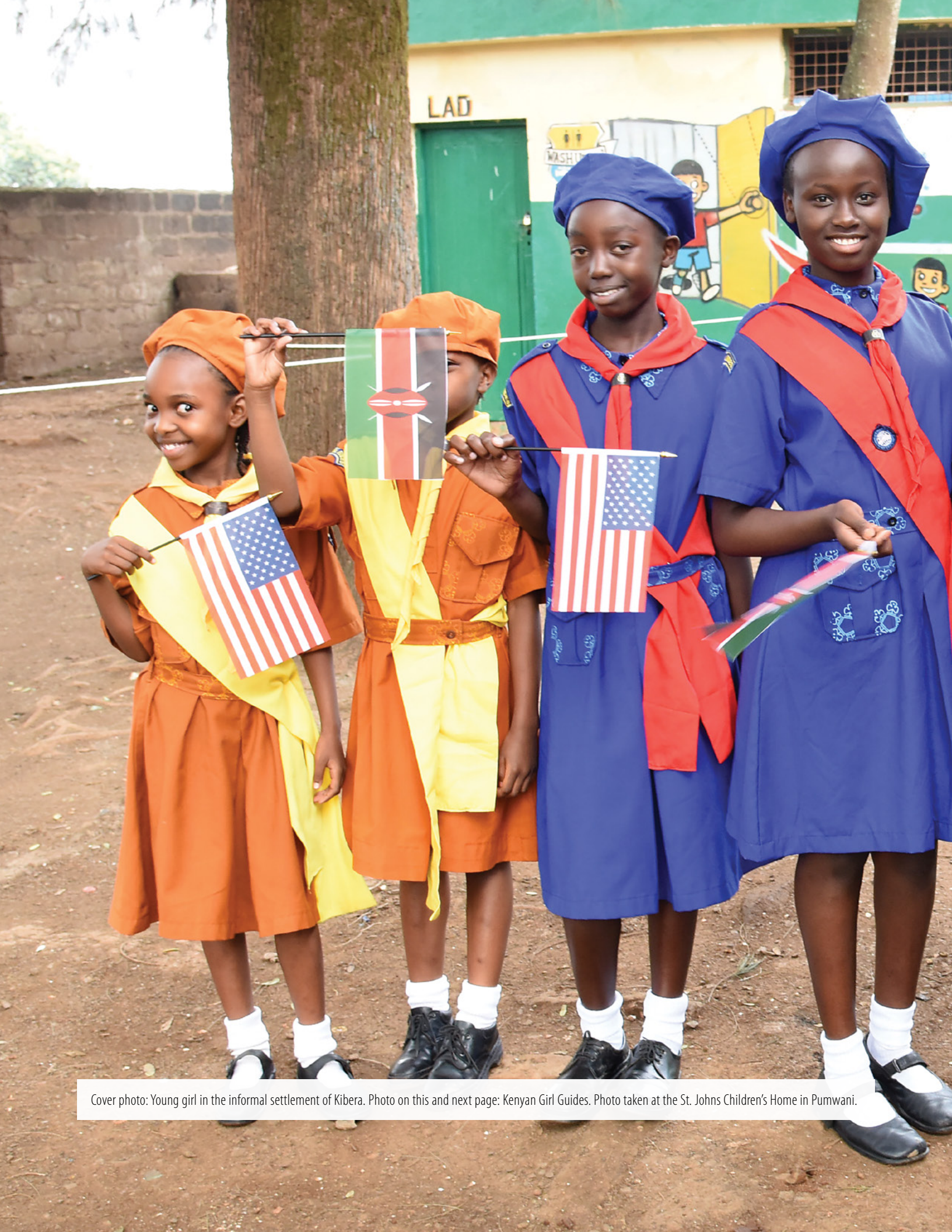
Cover photo: Young girl in the informal settlement of Kibera. Photo on this and next page: Kenyan Girl Guides. Photo taken at the St. Johns Children's Home in Pumwani.