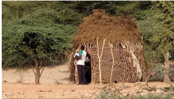
KENPHIA field teams visited remote areas to gather data on HIV and other conditions

Through PEPFAR, CDC actively participated in the implementation of KENPHIA, the Kenya Population-based HIV Impact Assessment. KENPHIA required teams to work extensively across the country, including with field-based laboratory work. KENPHIA has also provided opportunities to see how PEPFAR has improved lives for countless Kenyans.