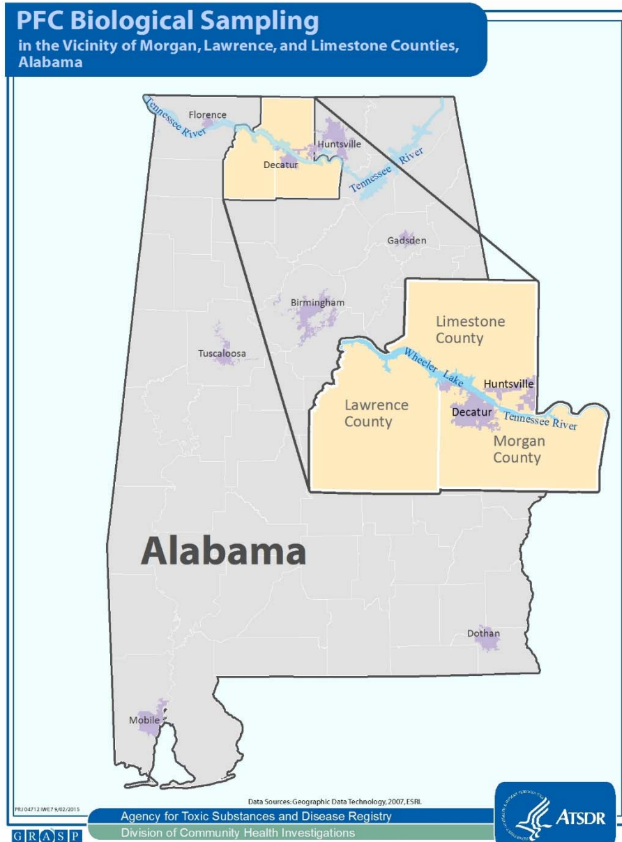
Figure 2: Map of Investigation Area - Morgan, Lawrence, and Limestone Counties, AL

Recruited participants were sent a letter that confirmed their participation, gave information about the investigation and provided a 1-800 number for participants to call and make sampling appointments. Seventy-eight of the 153 people who participated in the 2010 EI agreed to be re-tested and 46 people completed all portions of the follow-up investigation. One participant was excluded from aggregate data analysis due to reported occupational exposure to PFAS.