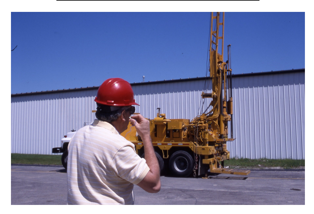
Scene 2: Roll and squeeze foam ear plugs

Before inserting foam earplugs, they should be rolled into a very thin, crease-free cylinder. In order to get the diameter of the cylinder as small as possible and crease-free, you should begin by squeezing the earplug lightly as you roll it between your forefinger and thumb. Then gradually apply progressively greater pressure as the plug becomes more tightly compressed.