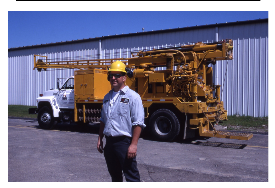
Scene 5: Both muffs and plugs for extremely loud noise

Extremely loud noise may include power saws, guns, pneumatic hammers, radio earphones, and jet airplanes at takeoff.