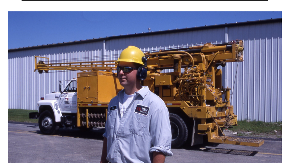
Scene 6: Glasses and facial hair can cause a bad seal

The ability of earmuff cushions to seal around the ear is reduced if they are worn over heavy beards, long hair or sideburns, and the sidepieces of eyeglasses. In these cases, the seal is likely to be altered, which will result in loss of hearing protection. To help in maintaining a good seal, it is important that eyeglass sidepieces fit close to the worker's head and be as thin as possible.