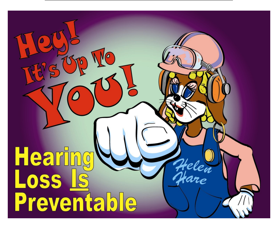
Scene 7: Wear hearing protection properly

Hearing loss can be prevented by protecting your hearing in every way possible. This includes wearing hearing protection both on and off the job.