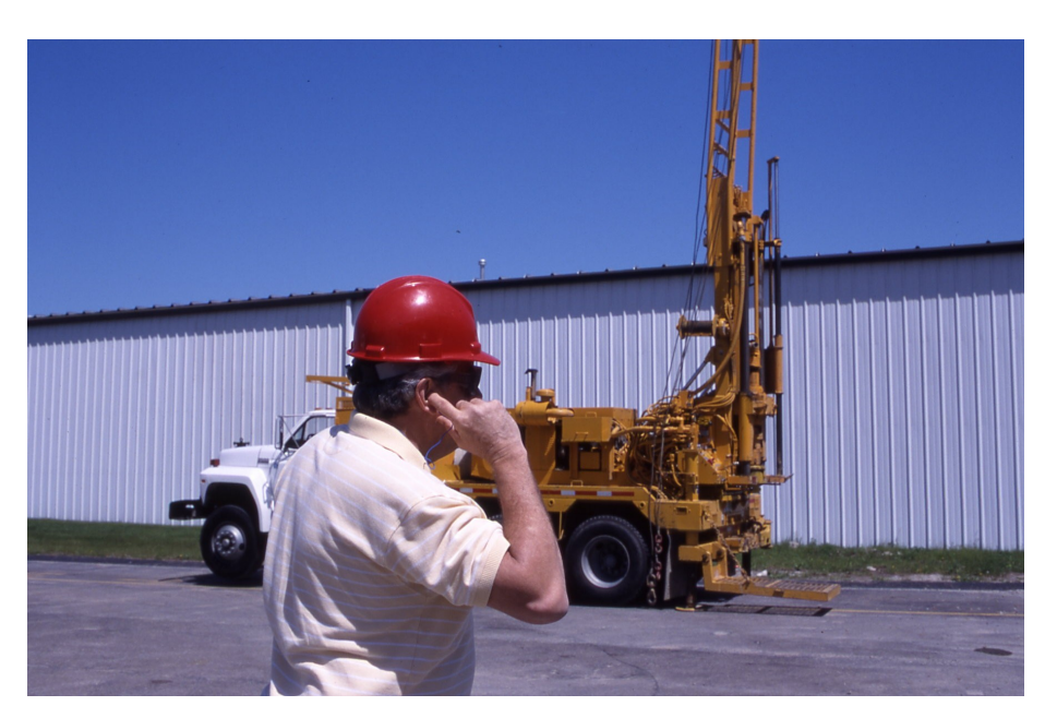
Scene 4: Hold plug in ear until expanded

Foam earplugs must be held in your ear with your finger for 10–20 seconds to allow them to expand. Then, to ensure the best fit possible, you should release and push again for another 5 seconds. At this point, the earplug will be positioned entirely within your ear canal.