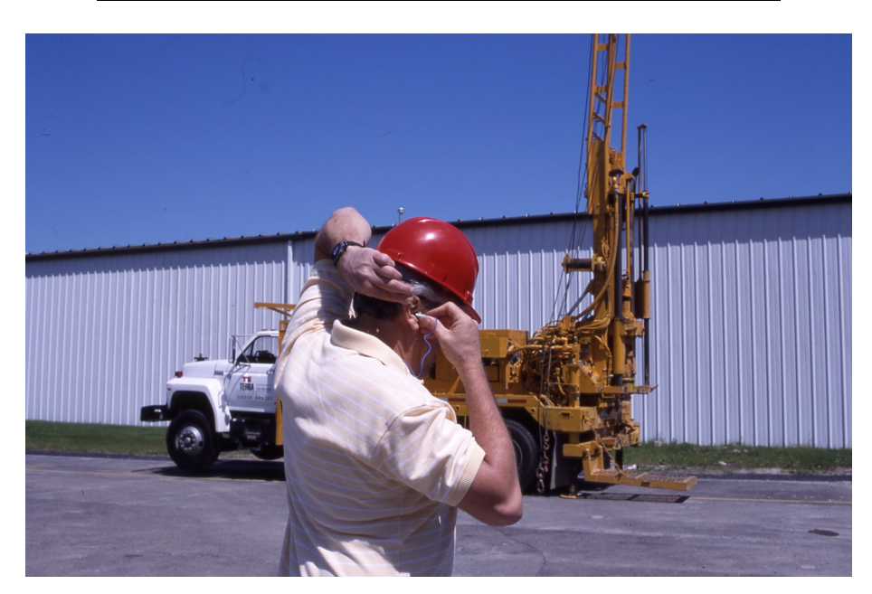
Scene 3: Pull ear up and back - insert rolled plug

In order for the rolled and squeezed cylinder to be inserted into your ear properly, you must reach one hand around the back of your head and pull up and back on your outer ear to straighten the ear canal. If the ear canal is not straightened out, the earplug cannot slide in far enough because of the natural curve inside your ear. You should be able to feel when the earplug is in far enough to provide a good seal.