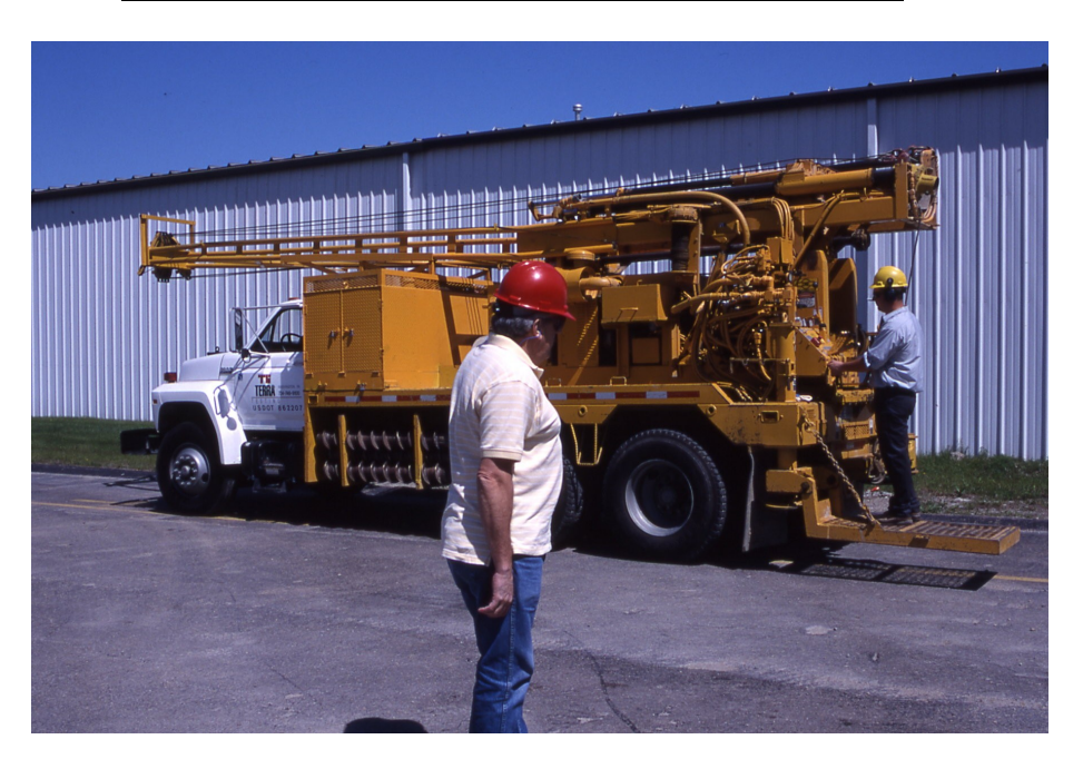
Scene 1: Wearing hearing protection properly

The two most common types of hearing protection used in the drilling industry are foam earplugs and earmuffs. To achieve maximum benefit from either of these, they must be worn properly.