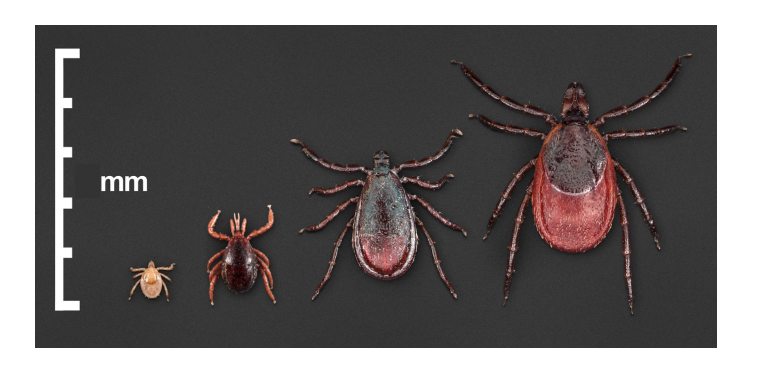
Figure 2. Blacklegged ticks. From left to right: larva, nymph, adult male, and adult female.