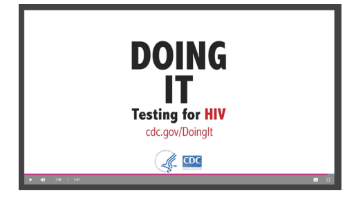
Public service announcements