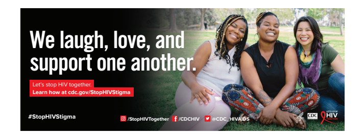
Brochures, palm cards, and posters