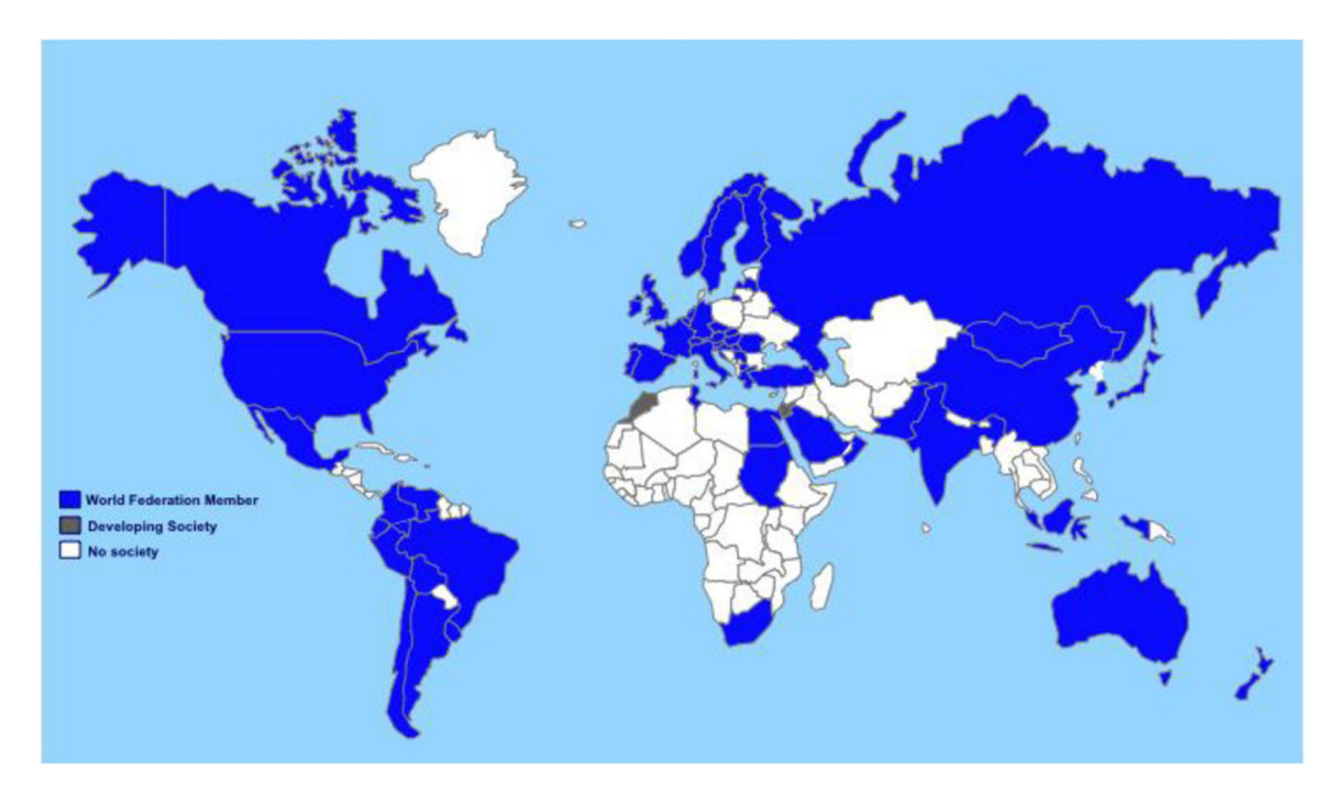
Figure 1 Accurate numbers of critical care centers and services worldwide are unknown. Membership in the World Federation of Societies in Intensive and Critical Care Medicine is used as an extrapolation of possible services worldwide, with countries illustrated where membership Societies are fully developed (blue), those where existing membership is developing a professional Society (gray), and countries without Federation members (white). (Adapted with permission from World Federation of Societies of Intensive and Critical Care Medicine. <sup>19</sup>)