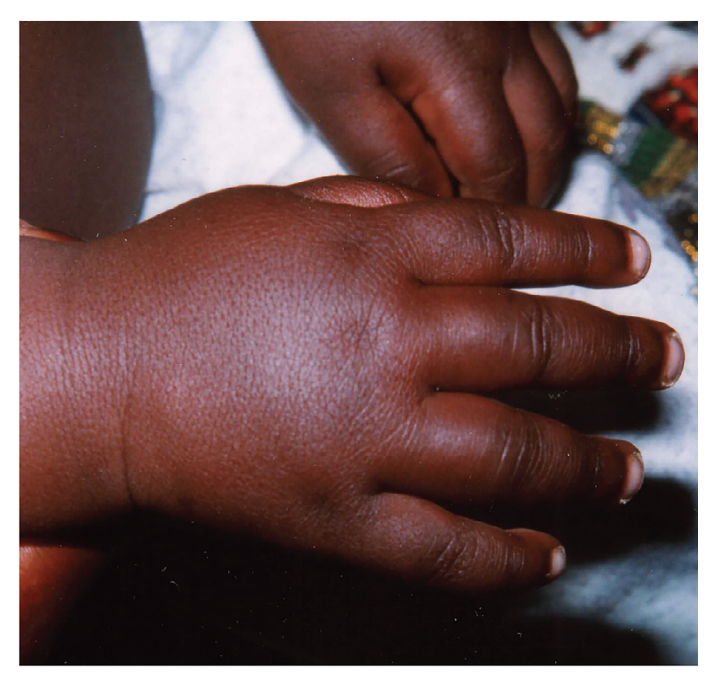
Figure 2. The hand of an infant with dactylitis—a painful swelling of the fingers or toes.