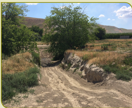
Coccidioides lives in dry, dusty soil. It was recently found in south-central Washington.

Scientists believed that Coccidioides only lived in the Southwestern United States and parts of Latin America until discovering it in south-central Washington in 2013 after several residents developed Valley fever without recent travel to areas where the fungus is known to live. Samples from one patient and soil from the suspected exposure site were analyzed using a laboratory technique called whole genome sequencing and were found to be identical, proving that the infection was acquired in Washington.