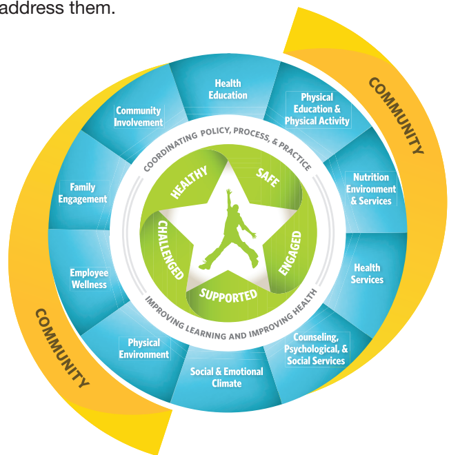
Figure 1. Whole School, Whole Community, Whole Child Model

Involving parents in school health activities can be an important strategy for getting schools to provide healthy school nutrition environments and services, opportunities for physical activity throughout the school day, and health services and support for students with chronic health conditions. Next, a brief overview is provided of these three topics and how schools and parents can work together to address them.