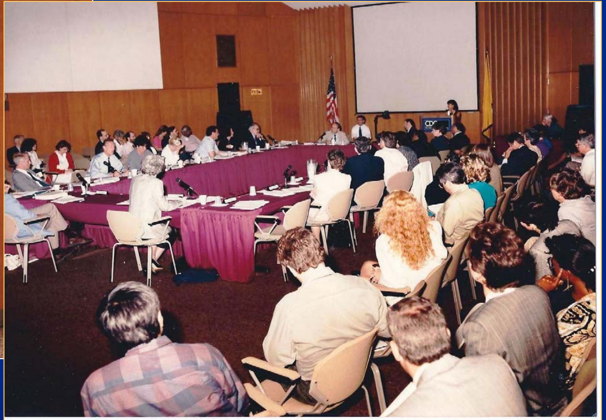
ACIP in “the old days” – Auditorium A, building 2 -- ~1990