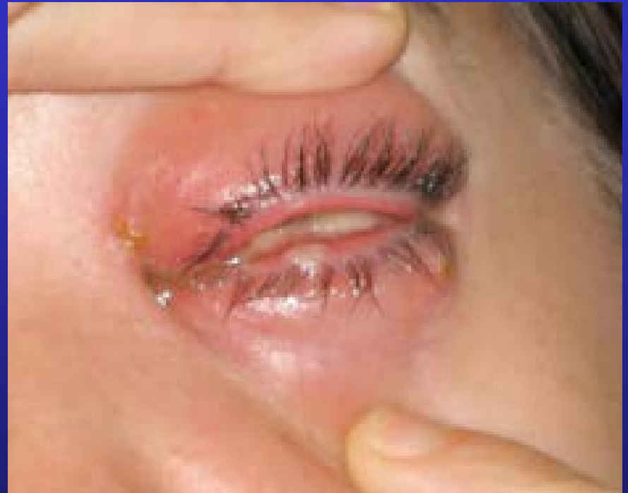
Satellite lesion: Lower conjunctiva

Lewis FMT et al. Emerg Infect Dis 2006;12:134