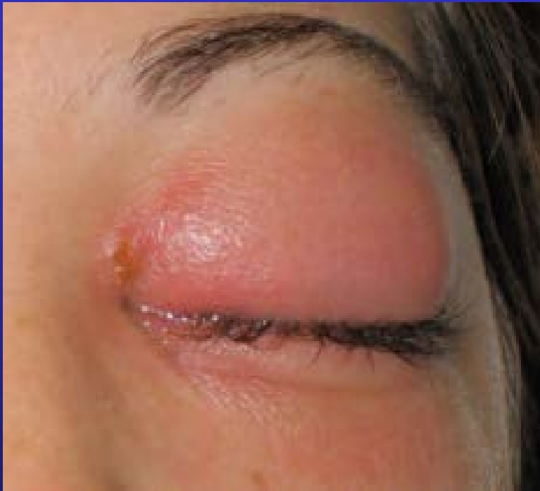
Primary lesion: Inner canthus