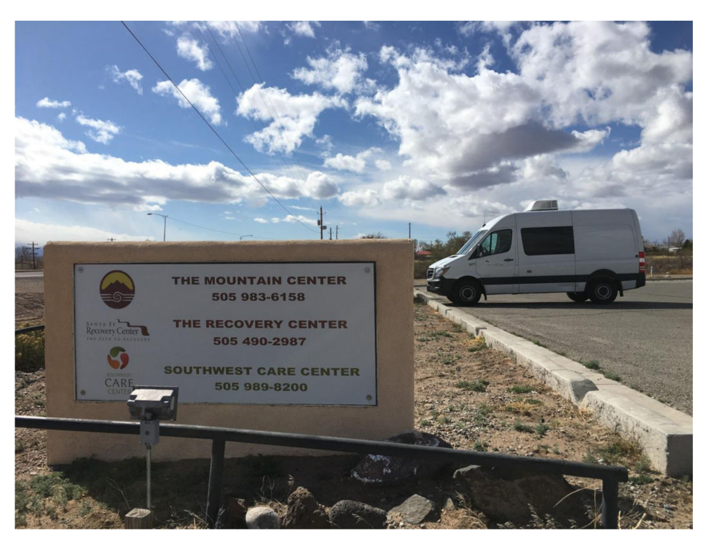
Figure 1. Photo of ¡VÁLE! study mobile clinic van at the Santa Fe Mountain Center in Rio Arriba County, New Mexico