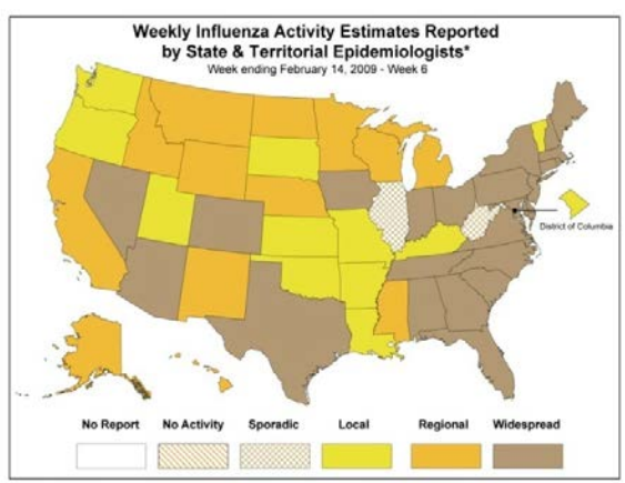
This map indicates geographic spread & does not measure the severity of influenza activity

Influenza activity is reported to CDC by state and territory epidemiologists each week. The following map reflects week 6. At this time, 24 states were reporting wide-spread activity, while the majority of the rest of the states were reporting regional or local activity. At this time last year, all of the states were reporting widespread activity with the exception of Florida: