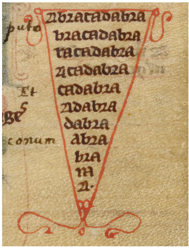
Liber Medicinalis (detail).

a narrow cone. Remember to tie these papers with flax and bind them round the neck."