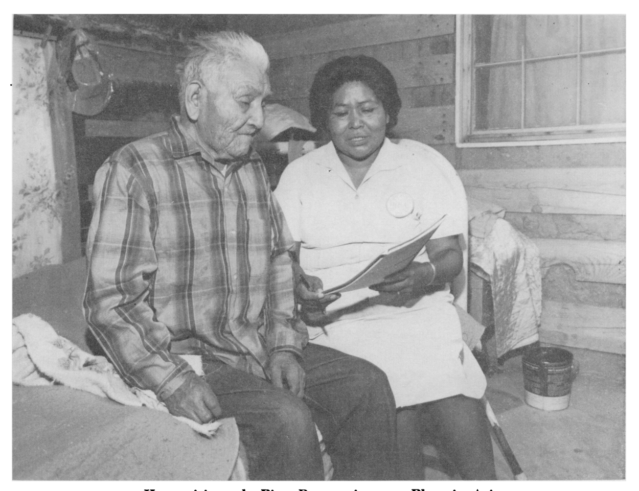
Home visit on the Pima Reservation near Phoenix, Ariz.

rose considerably at each successive clinic after community health representatives began to work. On one northwestern reservation, an unprecedented 85 percent of the village population turned out for examinations and immunizations at a general clinic. On a southwestern reservation, the community health representatives succeeded in getting 350 Indians to a conference on the problems of alcoholism.