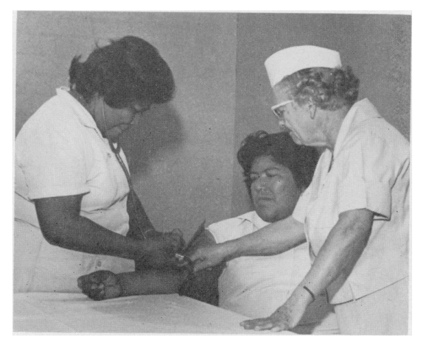
Community health representative learns to take blood pressure under direction of public health nurse at the Pima Reservation near Phoenix, Ariz.

The 4 weeks of intensive training at the Indian Health Service Training Center in Tucson, Ariz., followed by periods of varying lengths of training in the field at Indian Health Service units or other health resource locations at the State, county, city, and private levels, are not intended to turn out a health specialist. The training is designed to educate the trainees to