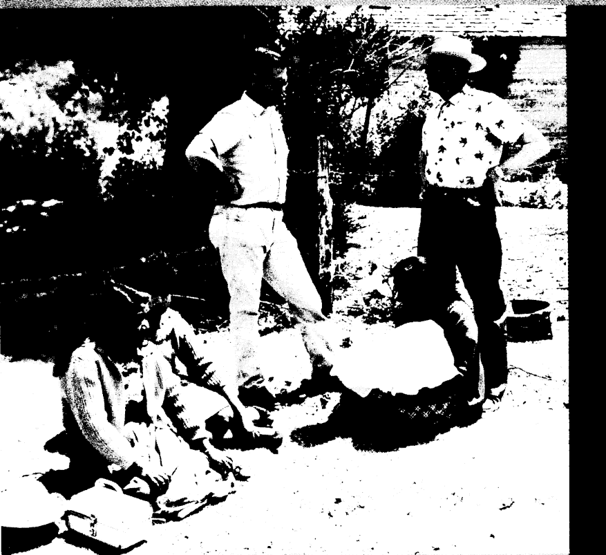
Community worker teaches a Supai family about water problems