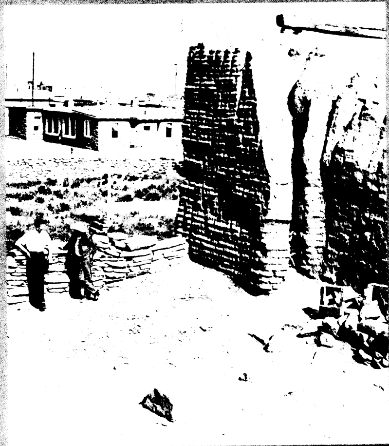
Health educators consult at the Zuni Pueblo