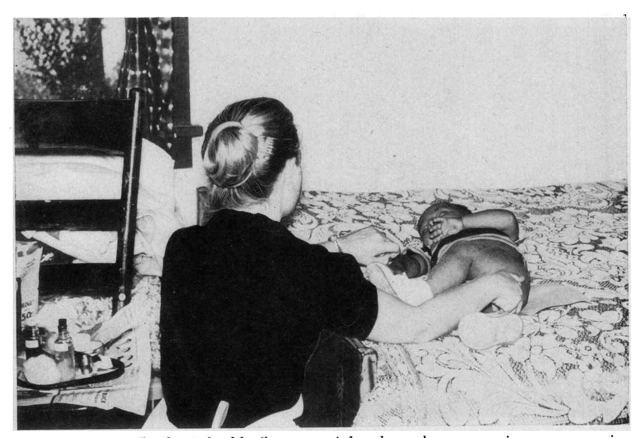
When a child is very ill and an isolated family cannot wait for a doctor, the nurse may give emergency service, plan for transportation, or take the family to medical or hospital care.