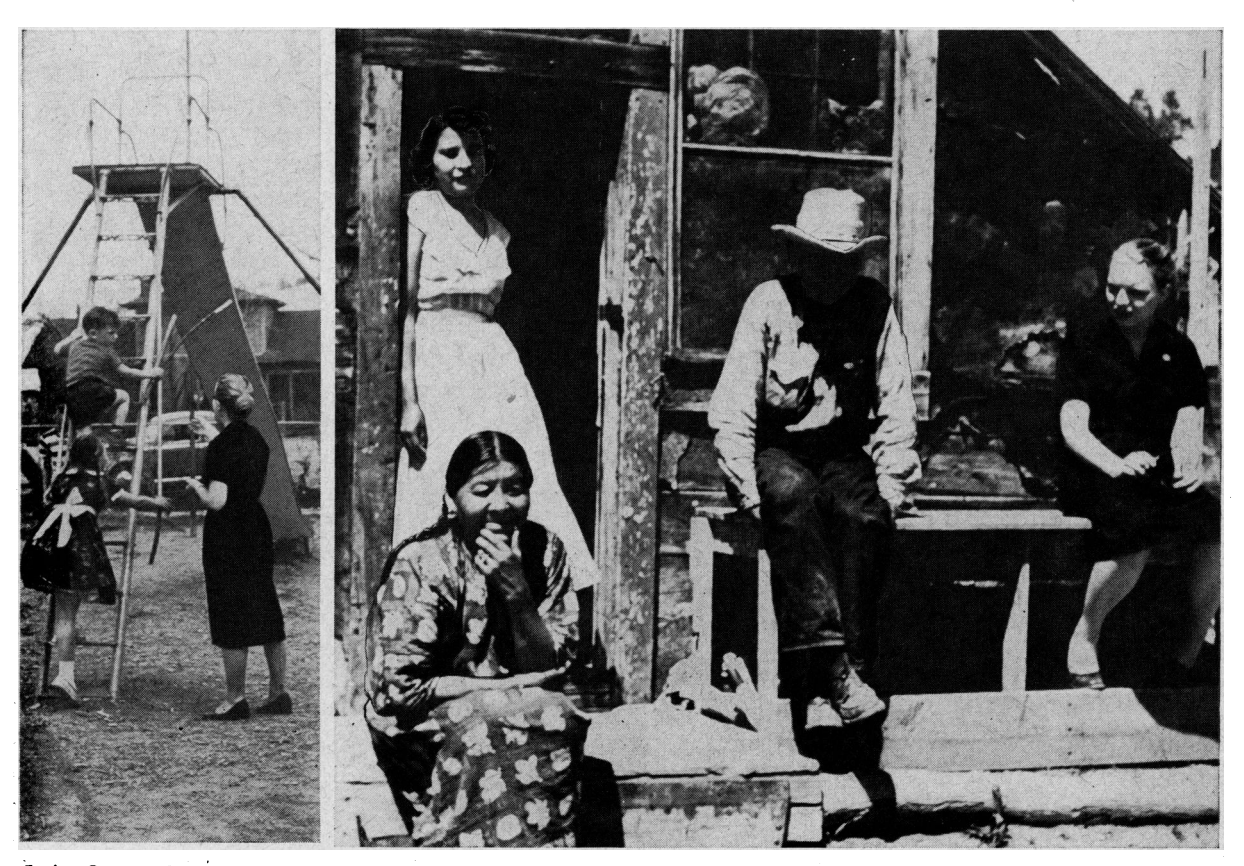
Left: On a school visit the nurse finds the slide needs repairs. Right: An Indian girl, torn between "living like others" and love of family, finds the nurse a friendly counselor.