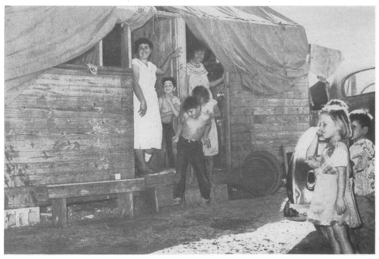
Many workers are accompanied by family dependents.

The remaining three-fourths of a million in the agricultural migrant population are workers and their dependents who come chiefly from the southern border States. Texas is the largest single supply State and the greatest demand State. Unlike the foreign workers with contracts, these domestic agricultural workers, who are United States citizens, seldom work under contract. Few have health insurance protection, and standards for their housing are likely to be minimal.