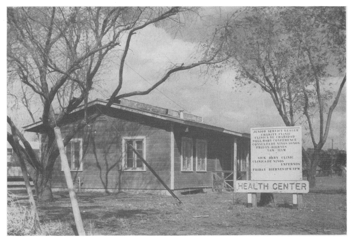
A health center operated by a voluntary group in a labor camp.

the peak. The peak period may last for only a few weeks or for several months.