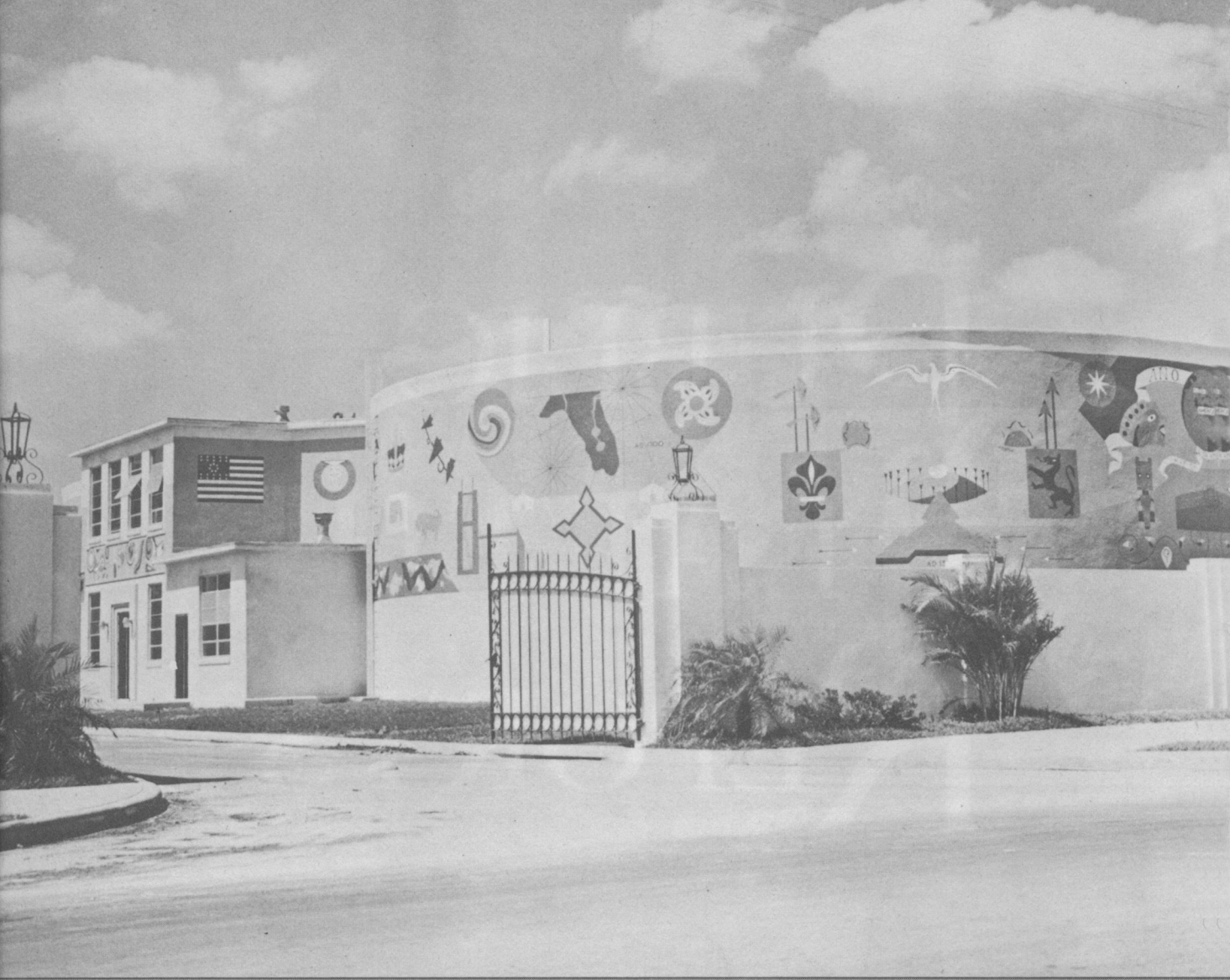
Coral Gables Sewage Treatment Plant