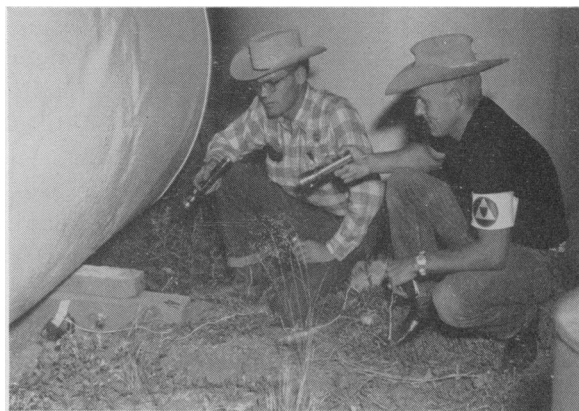
Sheriff and civil defense aide find "bomb" under oil tank in Durango suburban area.

If the watershed becomes contaminated with fallout, we would have enough stored water, once the reservoir is covered as planned for 1957, to last evacuees and residents 3 weeks. Water supplies have been tremendously improved this year over last by the addition of