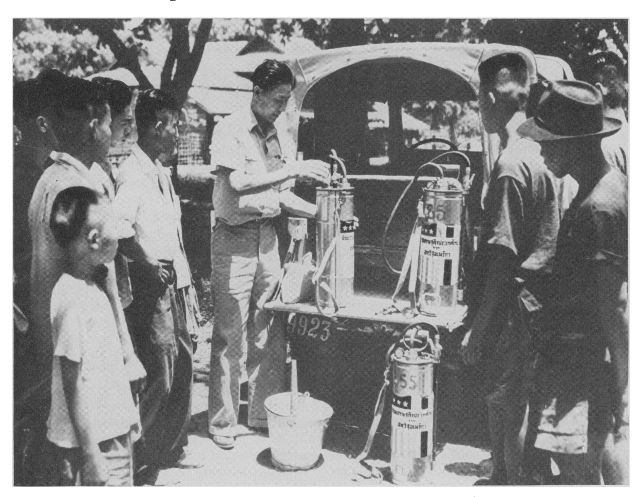
THAILAND—Assistant director of a malaria control unit demonstrates mechanism of spray guns.

Since any desire shared by a significant number of people constitutes a political force, it is apparent that the widespread urge for health manifest today is a highly potent political force demanding action. Its intensity is heightened in countries that have recently attained independence because self-rule is associated in men's minds with a good life. Why, otherwise, fight for it?