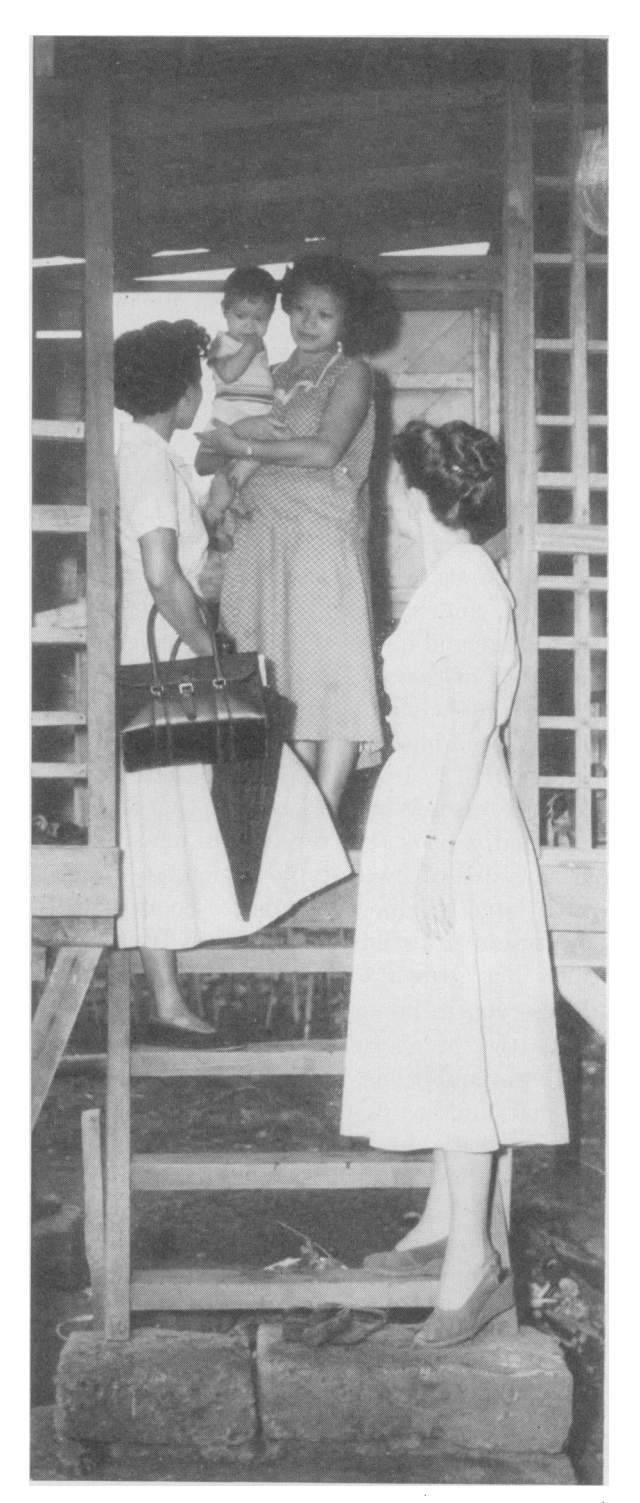
PHILIPPINES—A nurse from a rural health center visits a barrio under her jurisdiction. Her work and that of others like her is slowly replacing the work of the herbolarios and primitive jungle practitioners.

On a somewhat lesser scale, yaws, which is a particularly crippling and disfiguring chronic infection, presents a similar example of accomplishment in mass disease control. Within the last 6 years 35 million people have been examined for yaws, and 8 million have been treated. As recently as 1950, 50 percent of the total population of Haiti and an even higher percentage of its rural population suffered from