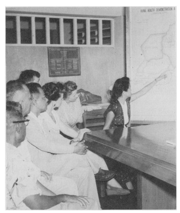
PHILIPPINES—A rural health specialist points to a demonstration area where Philippine personnel are being trained for service to families residing in remote areas of the islands.

number of countries—either as separate health plans, as in the case of the $75 million 5-year health plan in Iraq, or as a major segment of a general development plan, as is the case in Iran, India, and Pakistan.