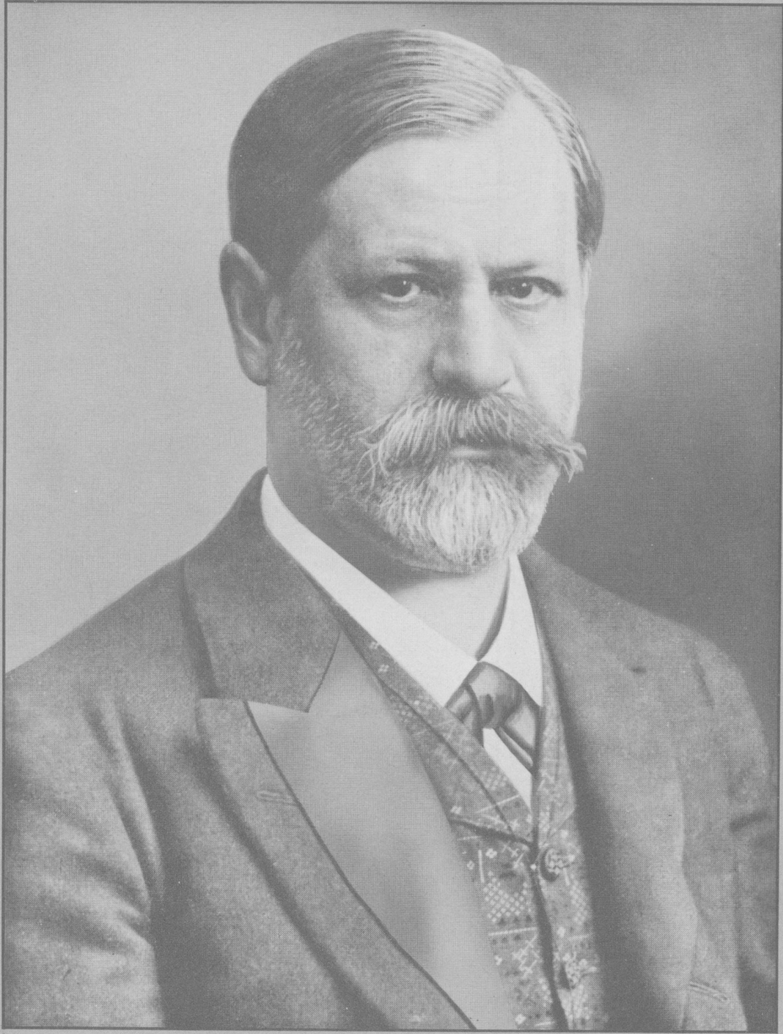
Sigmund Freud 1856-1939