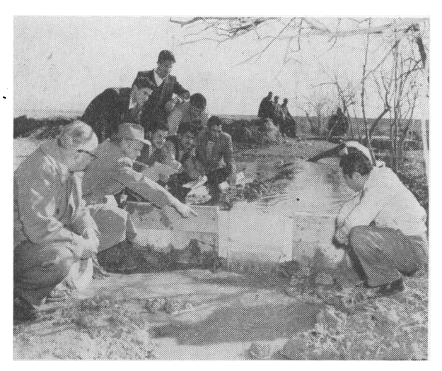
The use of a weir in measuring the volume of a stream is demonstrated to a sanitation class by Iranian and American instructors.

Operating out of these centers are small mo-