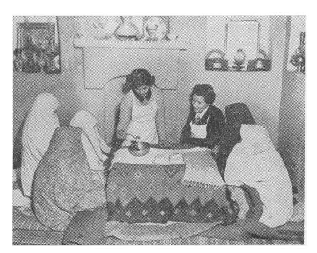
An Iranian nurse-midwife trainee, under the supervision of a United States public health nurse, is instructing village midwives in the proper method of sterilizing instruments.

All American health personnel in Iran are now assigned to functional positions in the cooperative, either in the central office or in one of the ostan offices, and the Ministry of