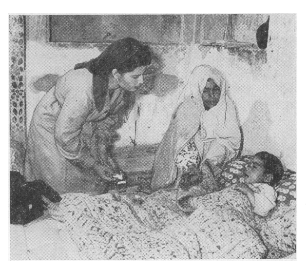
An Iranian health visitor from the village clinic staff treats a child who has measles complicated by pneumonia. The child did not die, as did most children in the years before when they suffered from this sequence of red spots followed by choking breath.

Health assigns personnel from its department of preventive medicine as mutually agreeable to the co-directors. Upon creation of the cooperative, all equipment, supplies, and facilities of the United States health mission and a considerable portion of those of the Ministry's department of preventive medicine were turned over to the organization, and specified sums of money from each country were consigned to the Iranian-United States joint fund. It was agreed that additional funds would be made available by both governments each year from June 30, 1953, through June 30, 1958. To augment these funds, the ostan cooperatives are encouraged to obtain contributions from local governments and organizations and from individuals.