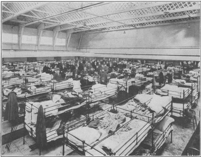
One of the men's dormitories.