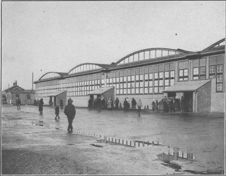
Typical exterior of the principal buildings at the Atlantic Park Hostel.