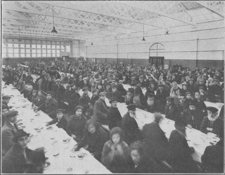
Interior of dining room, with passengers at meal.