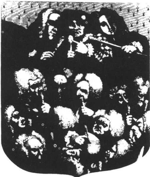
National Library of Medicine