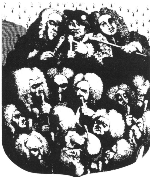
National Library of Medicine

After the conference, find out what REALLY happened!