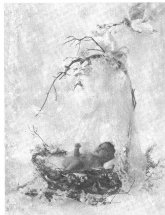
Cover: Helping to promote the Healthy Mothers, Healthy Babies campaign are the posters which appear on the front cover and the inside back cover of this issue of Public Health Reports . The posters, with messages in English or Spanish, are being distributed to neighborhood health centers and other facilities that provide health care for low-income women. On page 509 is an order blank for the series of six posters. The lead article in this issue describes the 50-member public-private coalition of organizations that is working to lower infant mortality and improve maternal and infant health.